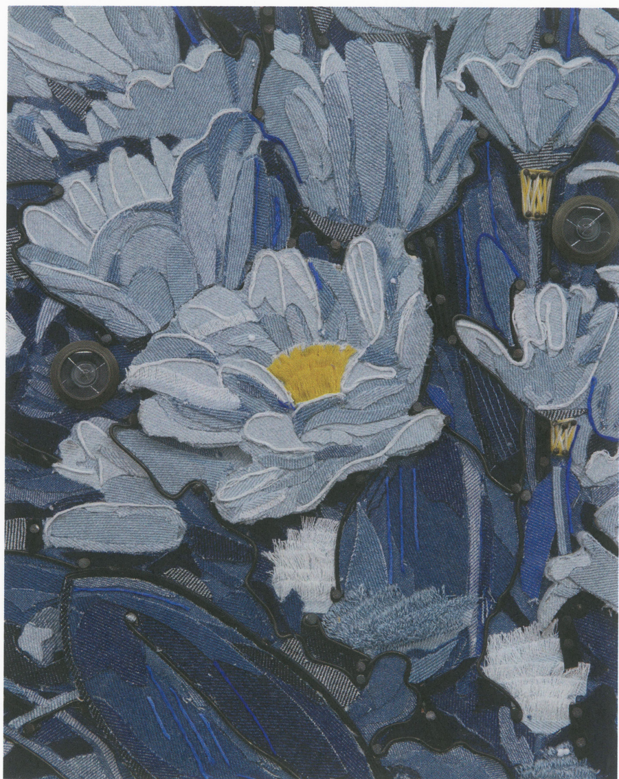
OPPOSITE: Fool Me Once, Shame on You. Fool Me Twice, Shame on Me (detail) . Denim, wire, electrical wire, embroidery thread and nails on plywood, 39.5 x 39 x 2 inches.