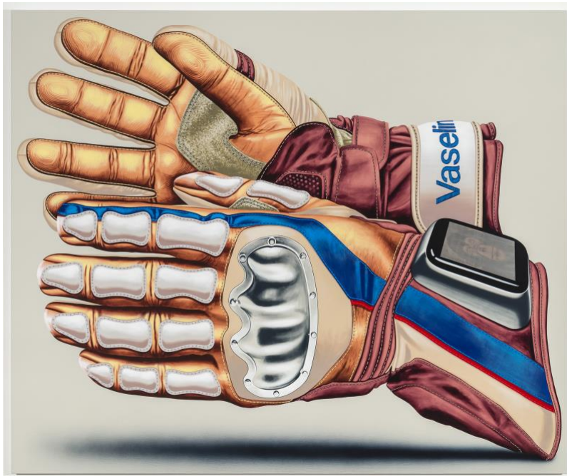
Impossible Grasp , 2019 acrylic on canvas 60 x 72 inches