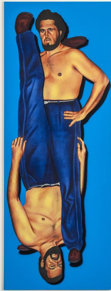
Scissor Lock , 2019 acrylic on canvas 96 x 36 inches