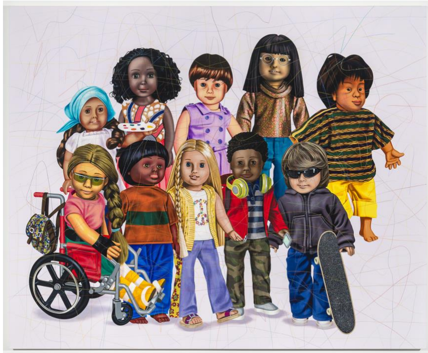
Plastic Dolls , 2019 acrylic and color pencil on canvas 54 x 66 inches