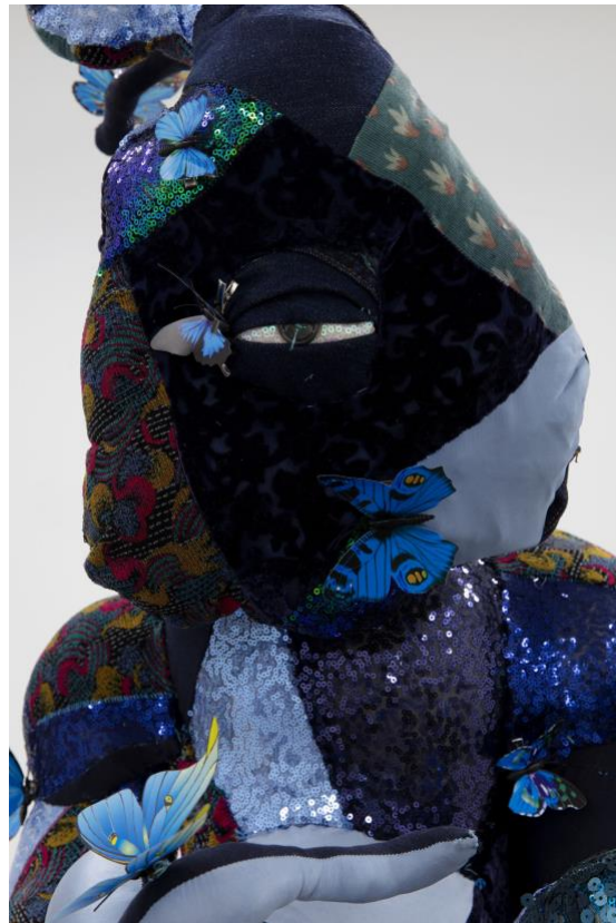
Detail of "Lil' boi blu" (2021), fabric, glass, sequins, wood, 87 1/2 x 34 x 18 inches.