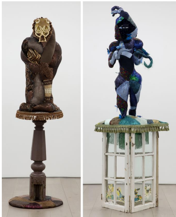
Left: "Perched" (2021), fabric, earrings, sequins, wood, 81 x 23 x 23 inches. Right: "Lil' boi blu" (2021), fabric, glass, sequins, wood, 87 1/2 x 34 x 18 inches.