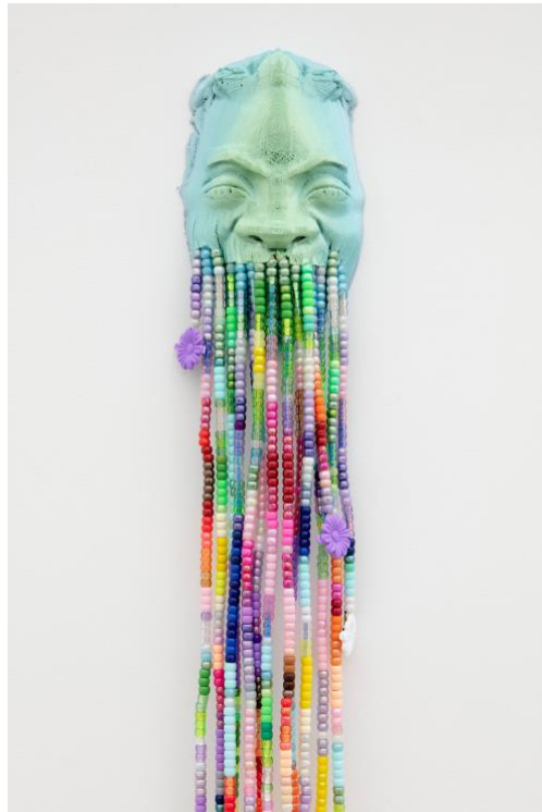
Detail of "I Break Too Easily" (2021), 3D printed PLA mask, beads, barrettes, 52 x 36 x 36 inches.