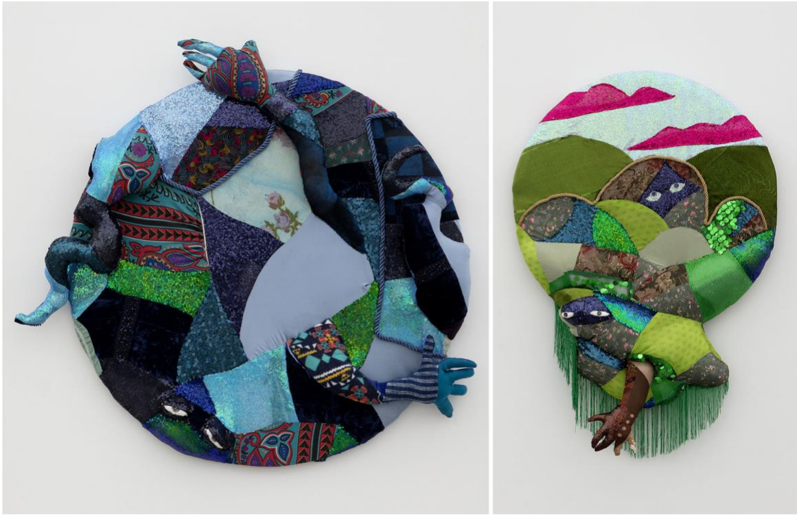
Left: "Untitled" (2021), oil on canvas and fabric stretched on panel, 39 x 42 x 3 1/2 inches. Right: "Untitled" (2021), oil on canvas and fabric stretched on panel, 53 x 36 1/4 x 11 inches.