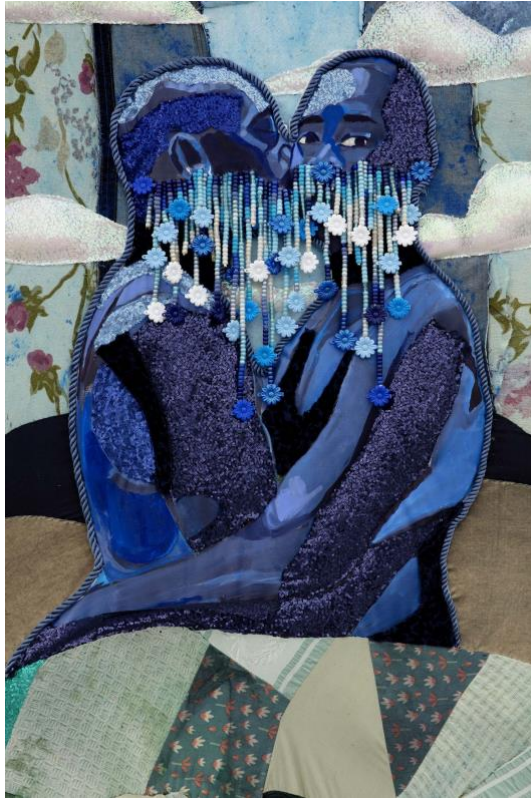
Detail of "Untitled" (2021), oil on canvas, fabric stretched on panel, plastic beads, and barrettes, 50 1/4 x 58 1/2 x 4 inches.