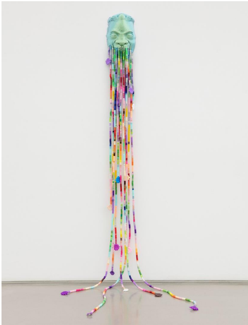
"I Break Too Easily" (2021), 3D printed PLA mask, beads, barrettes, 52 x 36 x 36 inches.