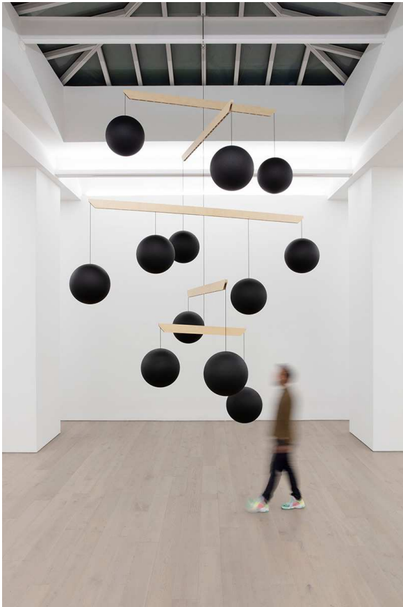
An installation view of Xavier Veilhan's show at Perrotin.