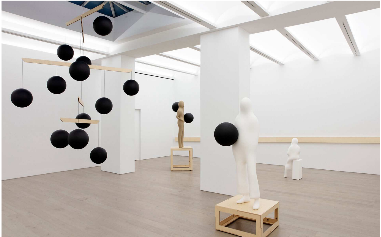
Xavier Veilhan's exhibition at Perrotin gallery.