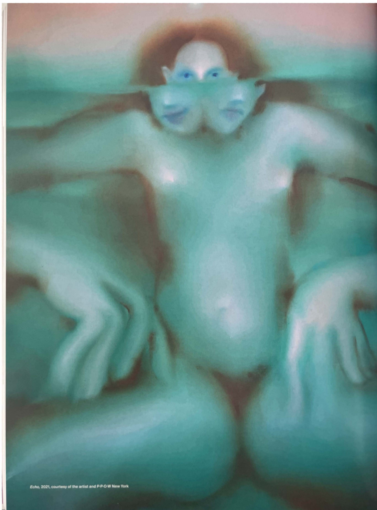
Echo, 2021