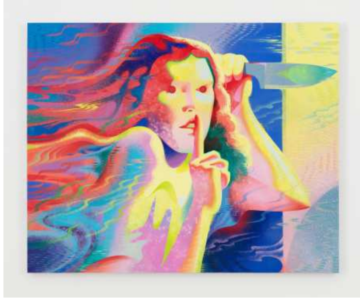
Robin F. Williams, Shhhh , 2022

Acrylic on canvas • 121.9 × 152.4 cm • Courtesy of the artist, Perrotin and P.P.O.W © JSP ART PHOTOGRAPHY