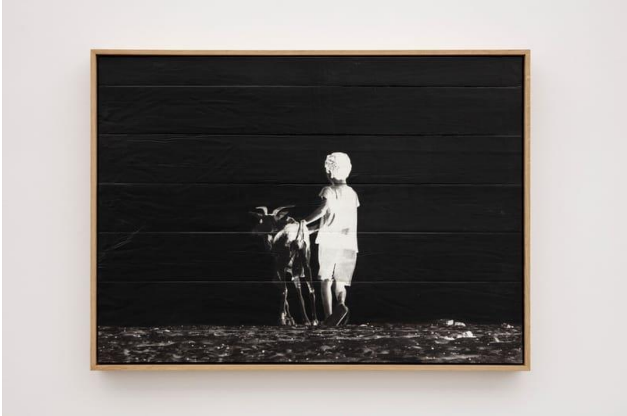
JR, Les Enfants d'Ouranos, Bois #5 , 2022.