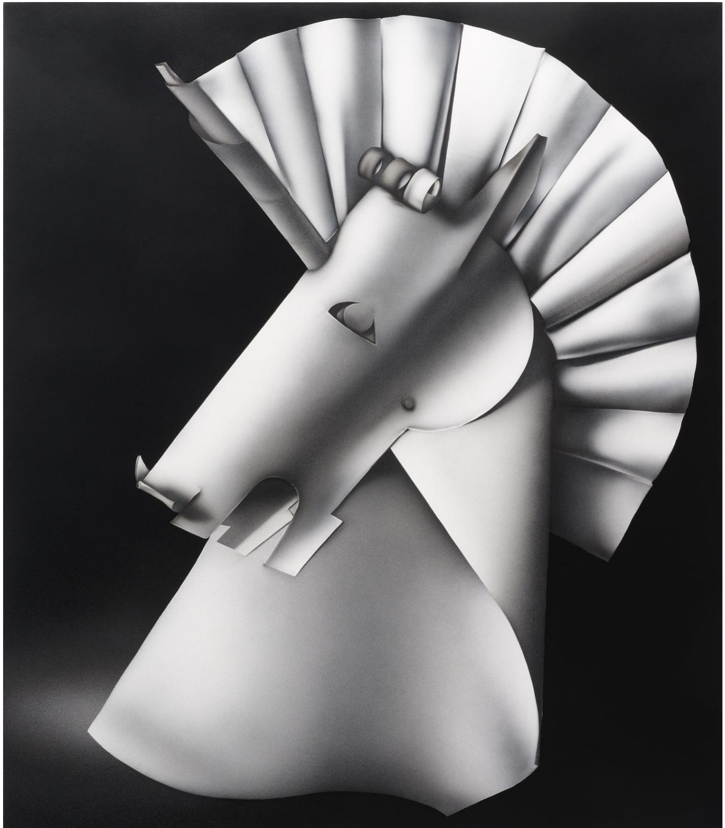
Fist Heart / Mighty Dawn Dart , 2020 acrylic and polymer automotive paint on canvas 38 x 33 inches