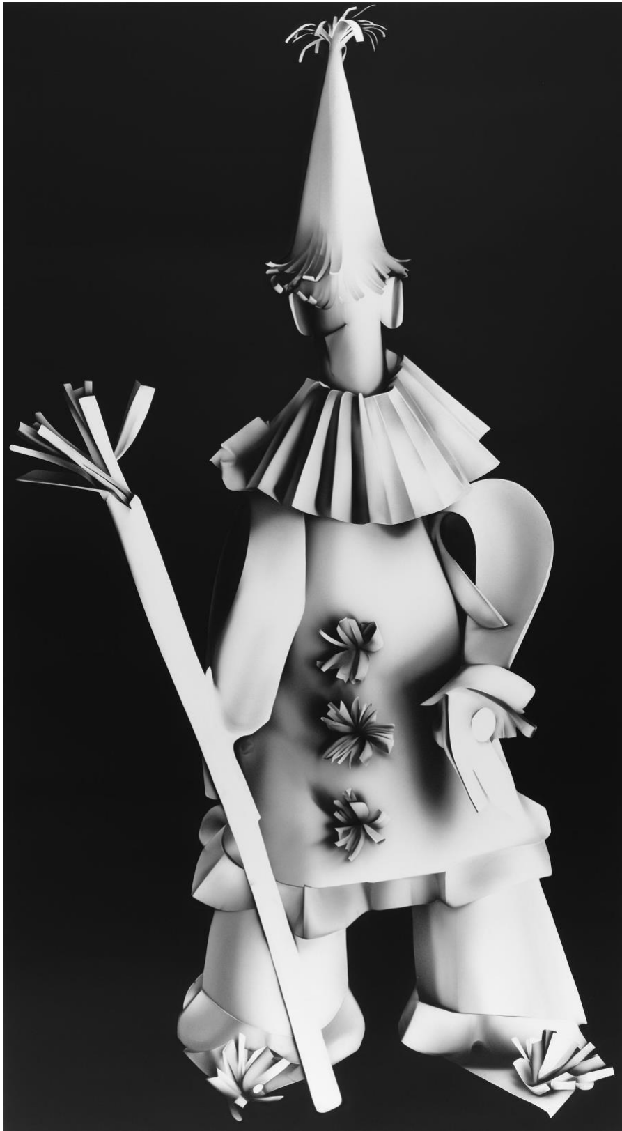
The Upside of Her Hell (Bozo Ode) , 2022 acrylic and polymer automotive paint on canvas panel 72 x 40 inches