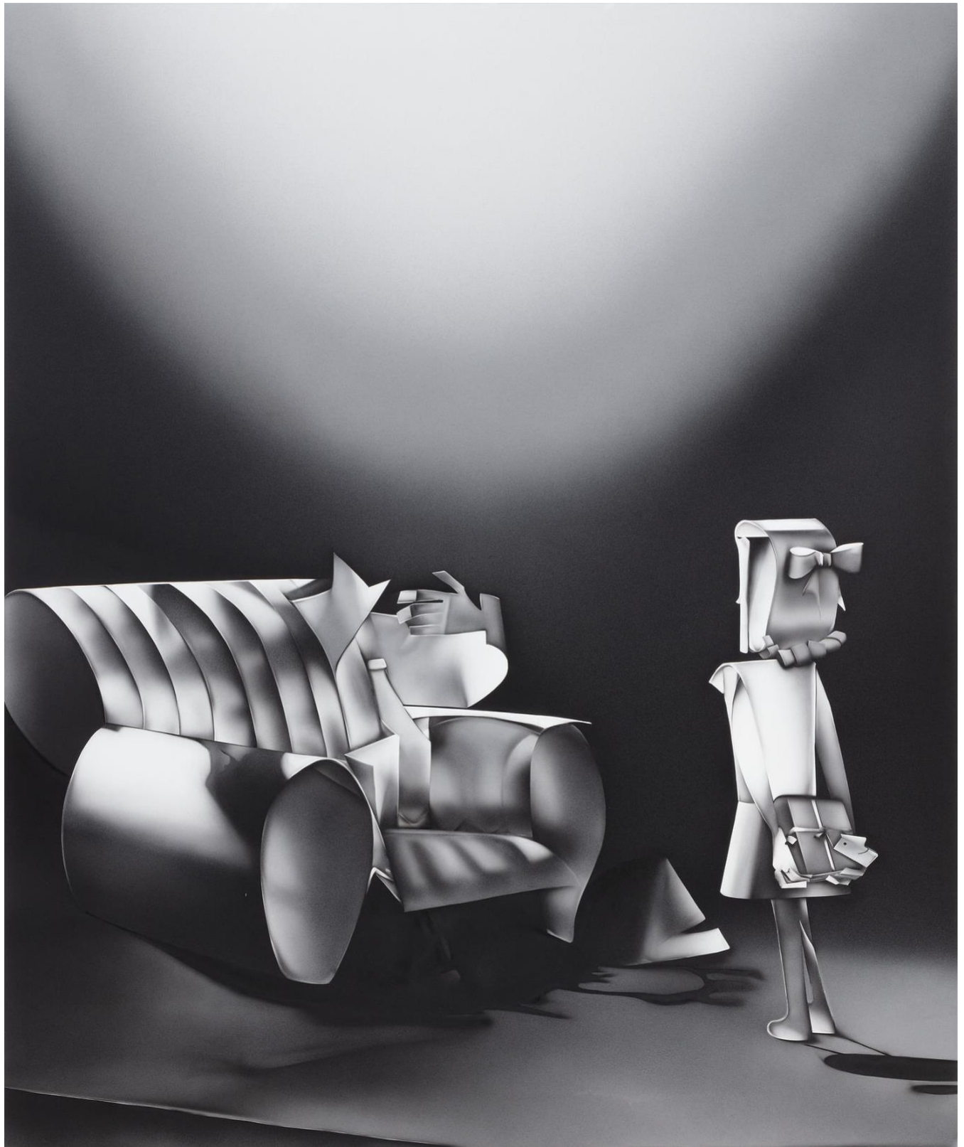
I had a slight Diversion but I'm back I'm back I'm back I'm back (the present), 2021 acrylic and polymer automotive paint on canvas panel 72 x 60 inches