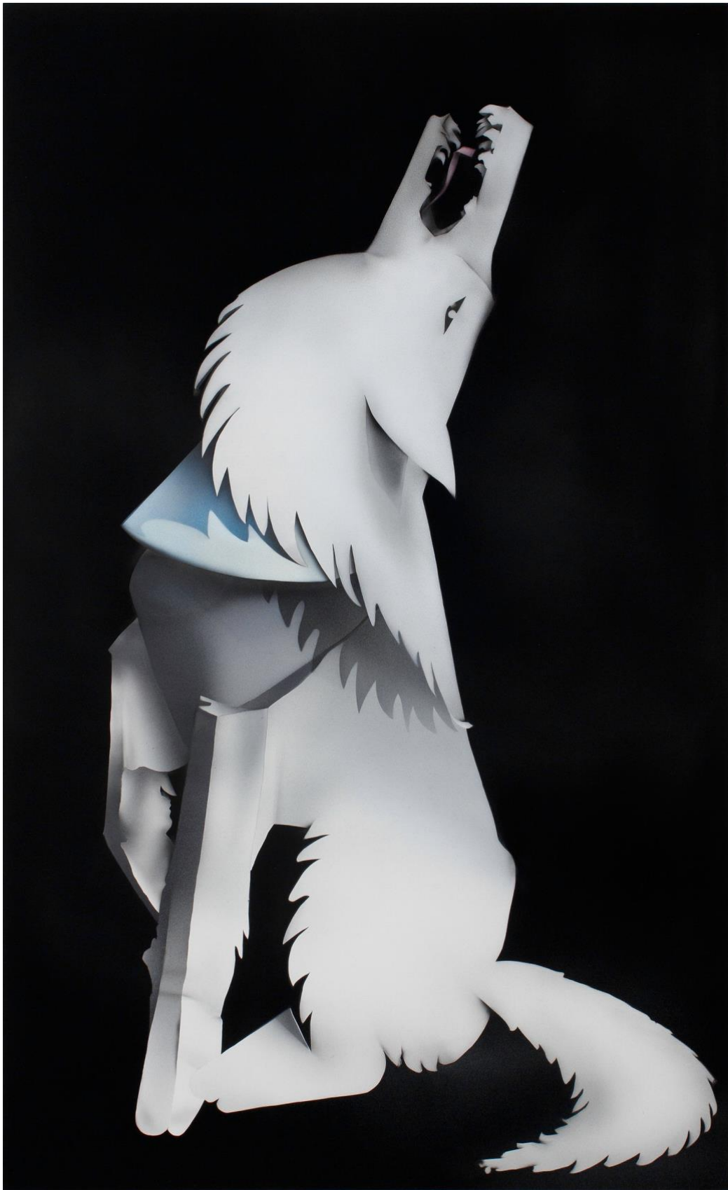
Trickster , 2019 acrylic and polymer automotive paint on canvas panel 60 x 36 inches