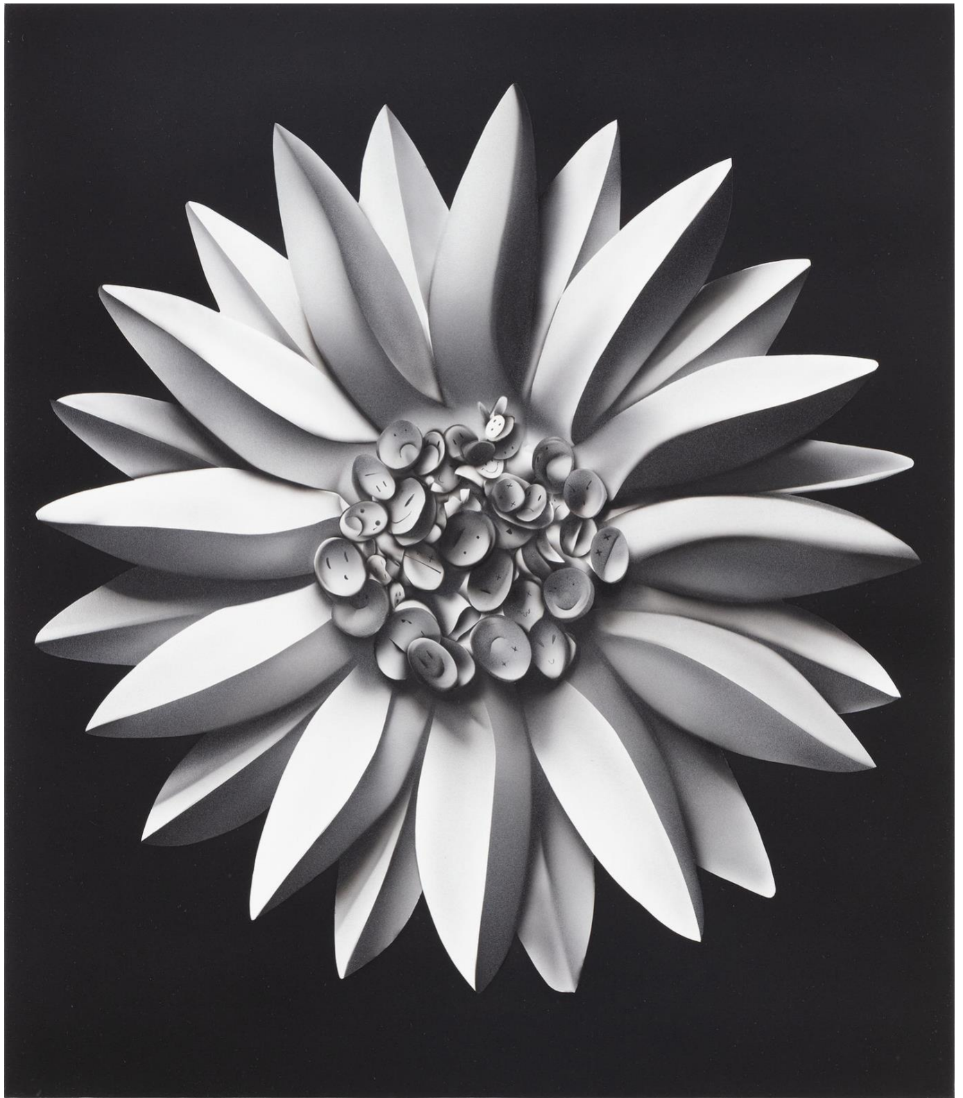
I Promise Not to Sell All Your Perfume Secrets (Scentless Apprentice) , 2021 acrylic and polymer automotive paint on canvas panel 38 x 33 inches