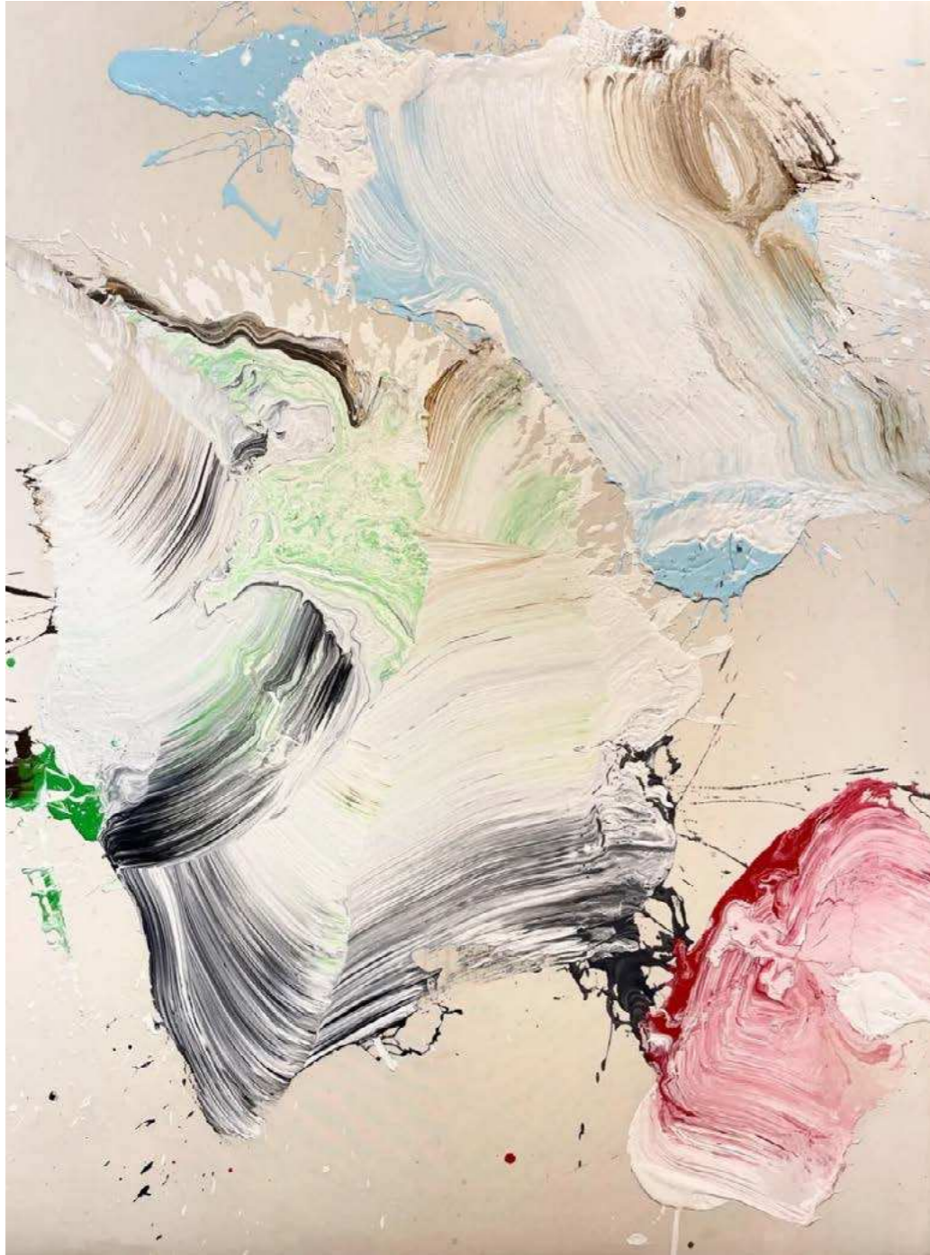
Ed Clark, Untitled 2011 at Hauser & Wirth, Art Basel 2023

Ed Clark's "Untitled, 2011" shows one of his latest works that immediately brings harmony and lightheartedness to the viewer. The late artist (1926-2019) was an abstract painter whose work has drawn accolades nationally and internationally. He is the first painter credited with working on a shaped canvas, an innovation that influenced contemporary art through the 1950s and 1960s. He is also known for his powerful brush stroke, large-scale canvases, and especially, his use of color.