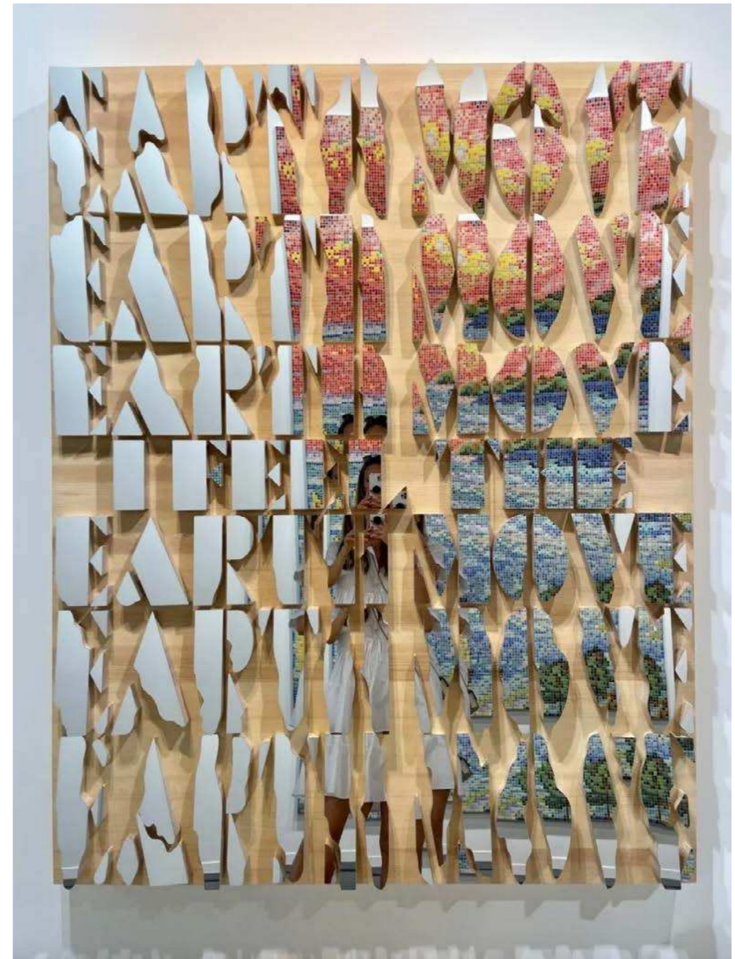
Doug Aitken

Doug Aitken's artwork "I Feel the Earth Move, 2023" is a captivating exploration of the dynamic relationship between humans and the environment. Created with his signature multimedia approach, the installation immerses viewers in a 3D experience. Through a mirrored sculpture, Aitken invites us to reflect on the profound impact of our actions on the Earth's ecosystems. "I Feel the Earth Move" prompts a deep introspection, urging us to reconsider our role as custodians of the planet. Aitken's evocative and thought-provoking work serves as a poignant reminder of the urgent need for environmental awareness and stewardship in an ever-changing world.