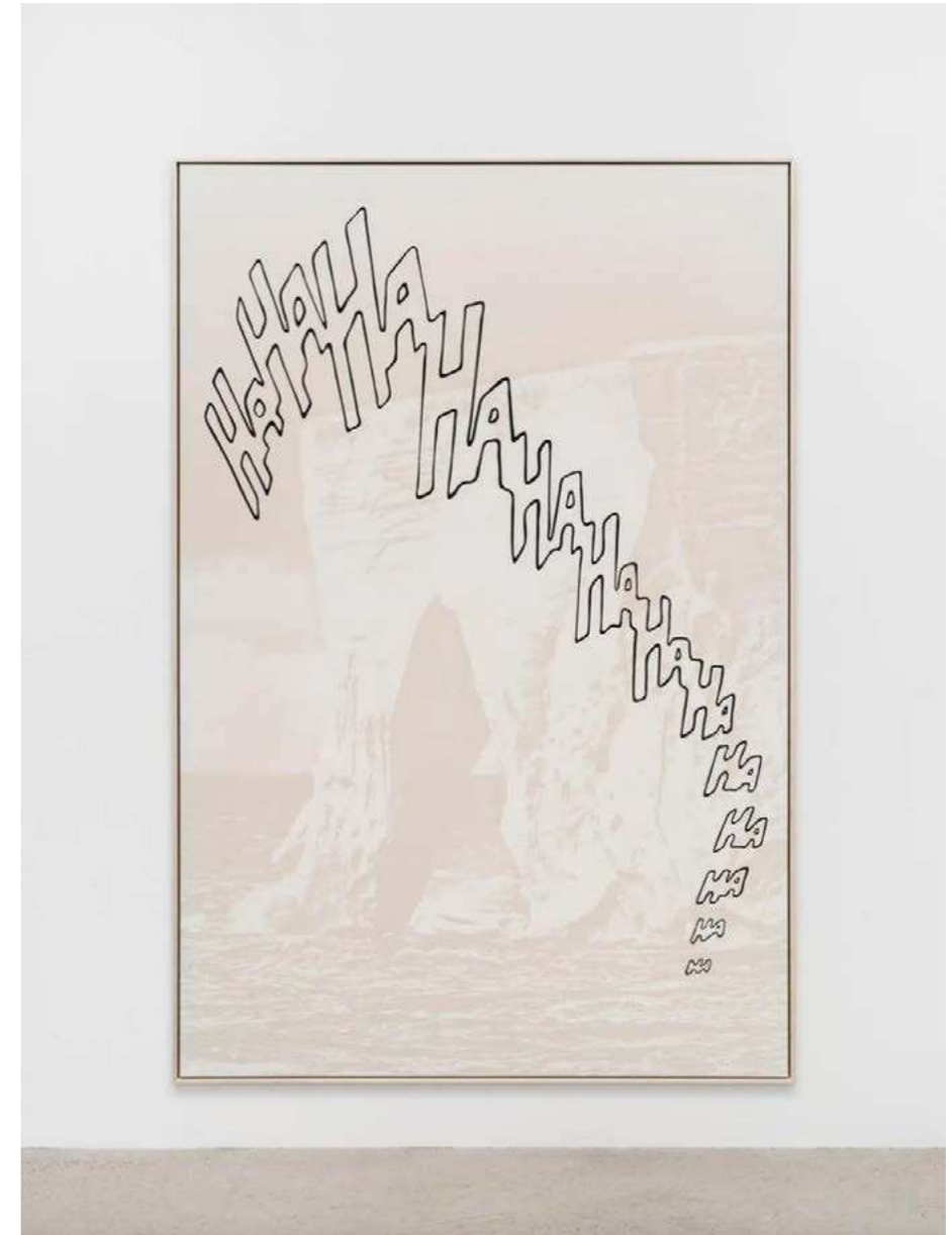
A Large Tabular Iceberg Floating in Antarctica (hahaha painting), 2022 Direct digital print and acrylic on canvas 244 x 163 cm (96 1/16 x 64 1/6 in) UBS Art Collection CLAUDIA COMTE

A standout feature of the fair is the UBS Lounge, themed around "Reimagining: New Perspectives". Featuring artworks by female artists, recently acquired by the UBS Art Collection, it explores themes from identity and perception to the environment and social change. It is a pleasure to return to Lounge and witness the Collection evolve, spotlighting talented artists who tackle today's most significant concerns.