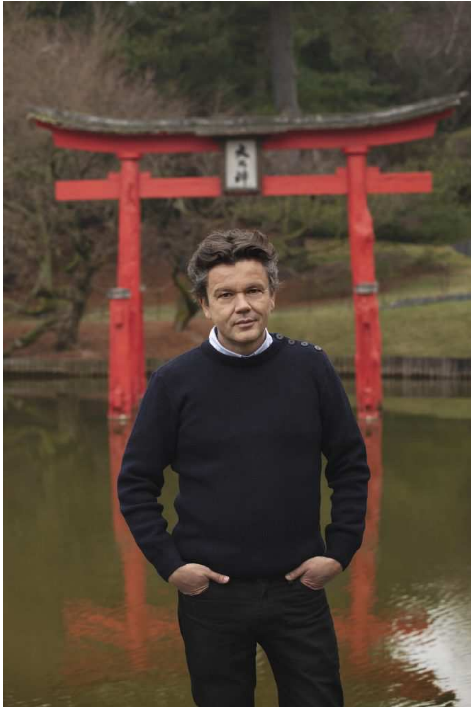
The artist Jean-Michel Othoniel.

Othoniel's art style might be familiar from his iconic Palais-Royale metro station in Paris. He had a 2012 survey that stopped at the Centre Pompidou, Brooklyn Museum, and other institutions. He has a permanent installation at the Château de Versailles, a dramatic serpentine fountain emerging in the palace's lush garden.