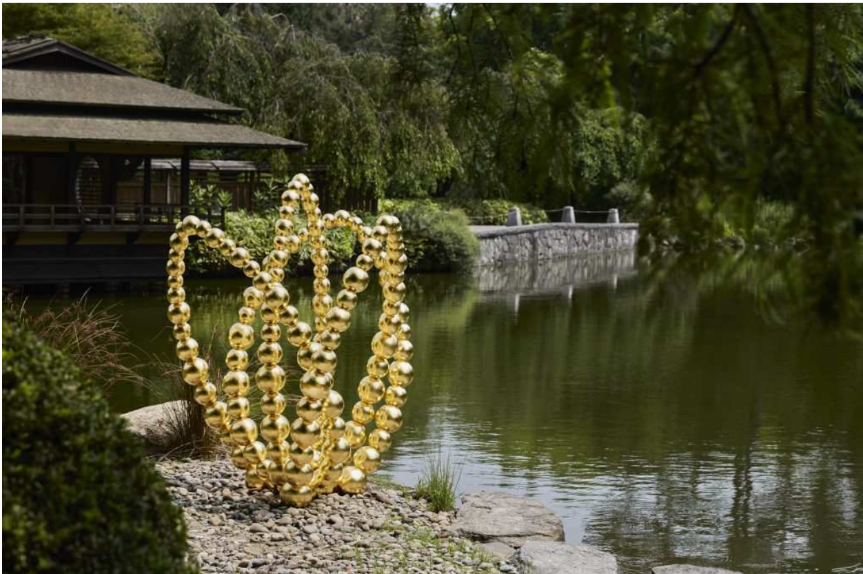
Jean-Michel Othoniel's "The Flowers of Hypnosis" at the Brooklyn Botanic Garden. Photo: Michelle Huynh. Courtesy of Dior. © Jean-Michel Othoniel / ADAGP, Paris & ARS, New York 2023.

It's the season for glistening, metallic flowers to bloom in Brooklyn. Come to the Brooklyn Botanic Garden for the majesty of nature (and 12,000 different plants), stay for the French artist Jean-Michel Othoniel's sublime floral sculpture exhibition.