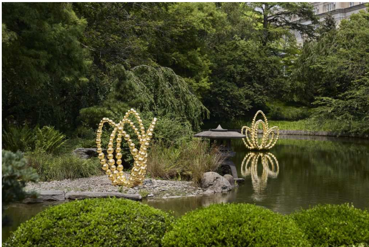
Jean-Michel Othoniel's "The Flowers of Hypnosis" at the Brooklyn Botanic Garden.

“The Flowers of Hypnosis” opened last month and runs until October 22. It consists of six site-specific pieces and took Othoniel a year to produce. Using his signature strands of hammered steel spheres, Othoniel conjured visions of lotus blossoms and a shiny rose. As per the title, it is meant to be a heady, thought-provoking experience, as well as a journey into Zen.