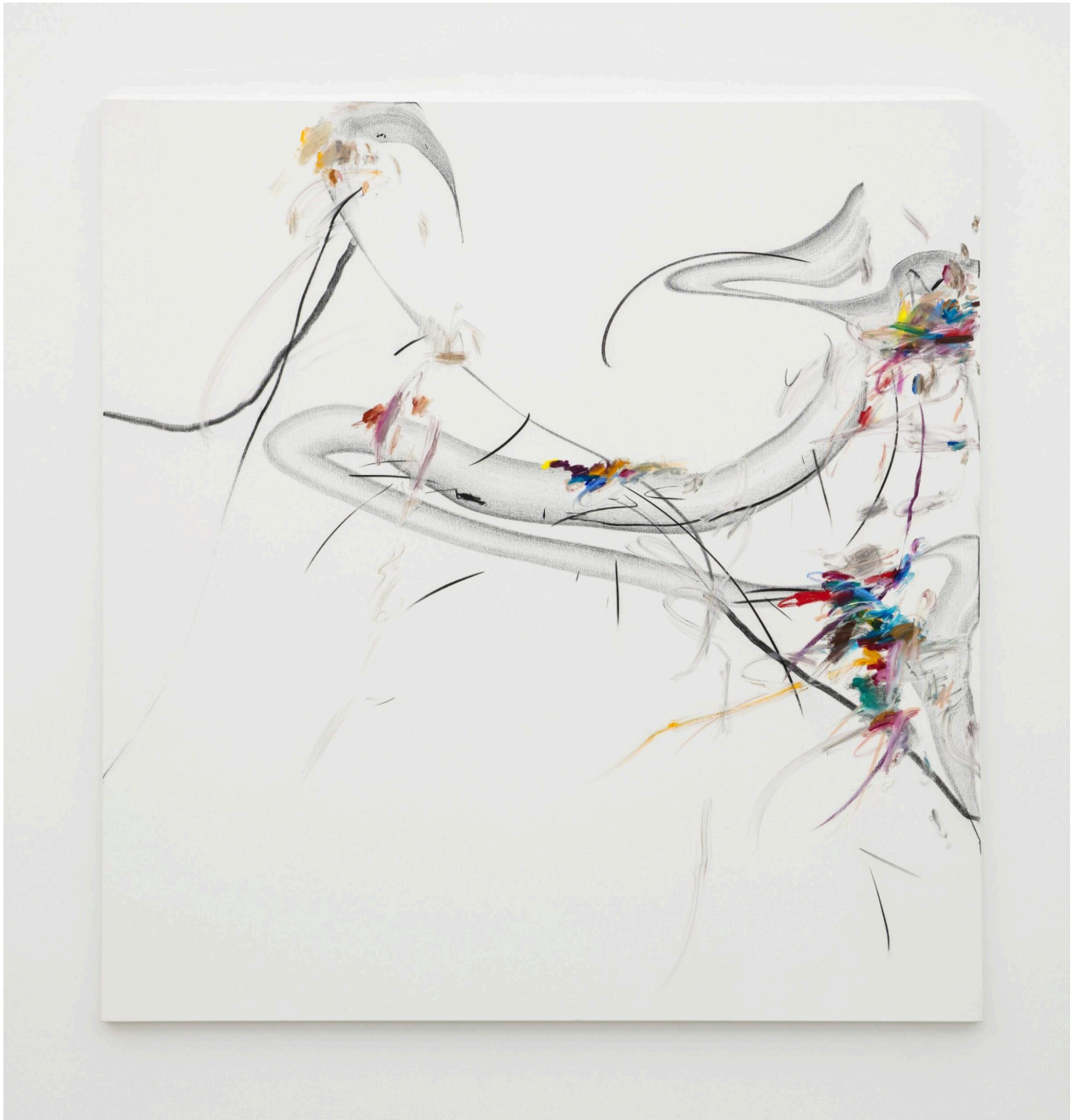
Do you hear the waterfall? No. 2, 2023.