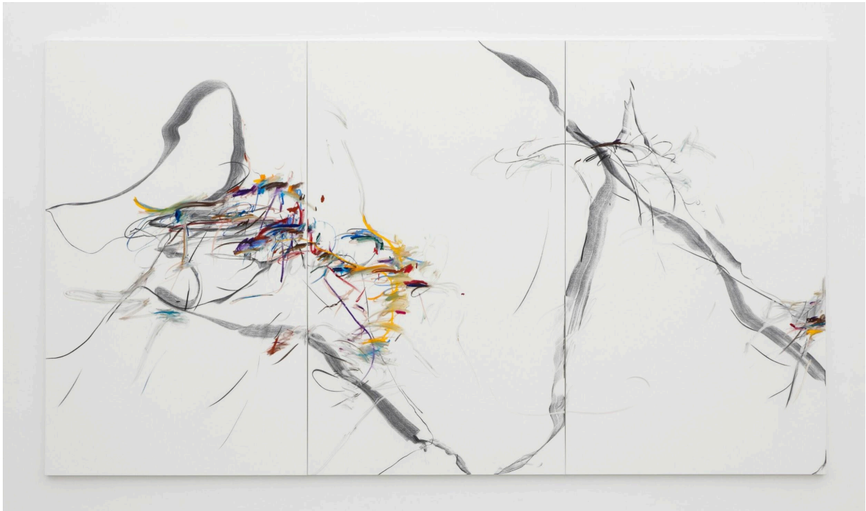
Zhuangzi Dreaming of Becoming a Butterfly No. 1, 2023.