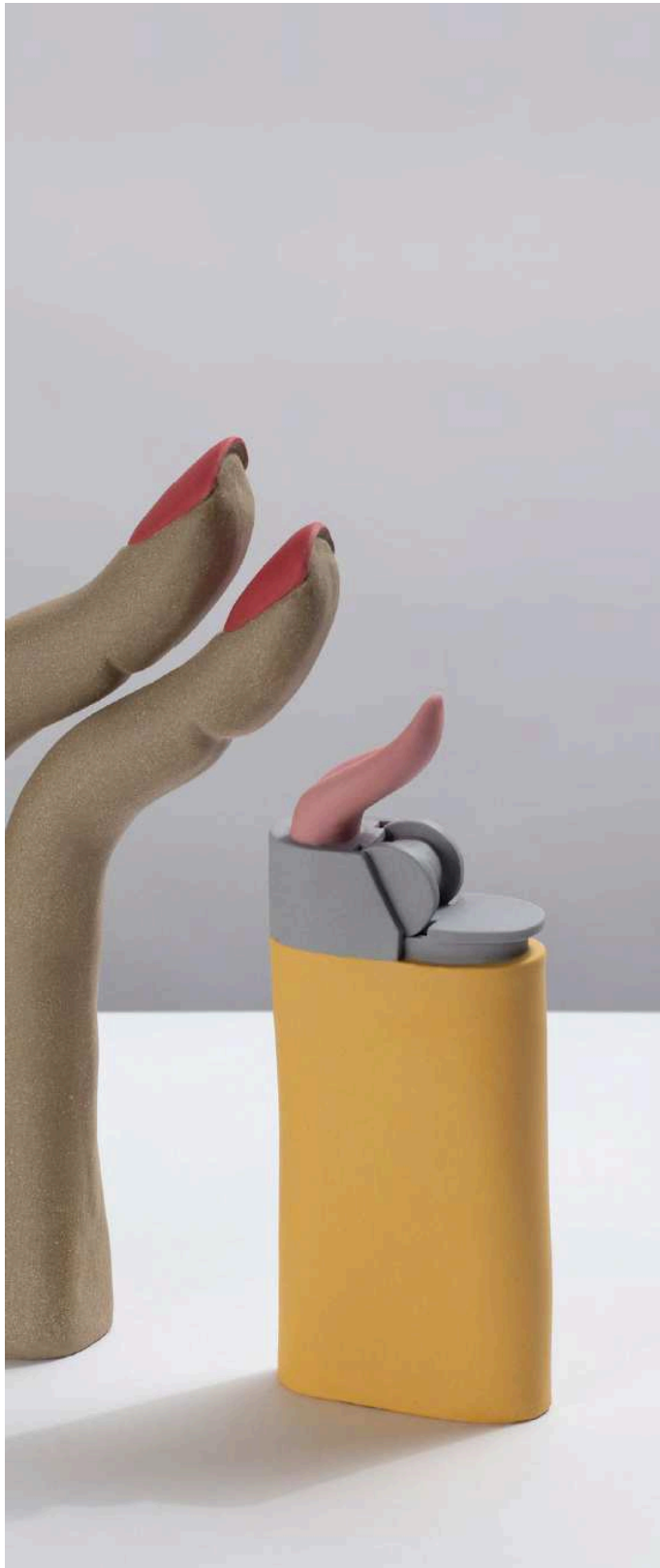
GENESIS BELANGER Flurter , 2018 porcelain and stoneware 28 x 39 x 8 cm Courtesy the artist and Nathalie Karg Gallery, New York