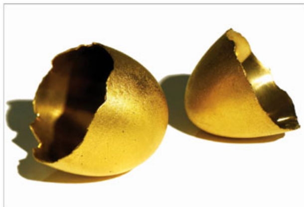
Dove Bradshaw, Nothing III , 2004, 24-carat gold over bronze cast of a goose egg shell, 2 1/2" x 5" x 2 1/2". Danese/Corey.