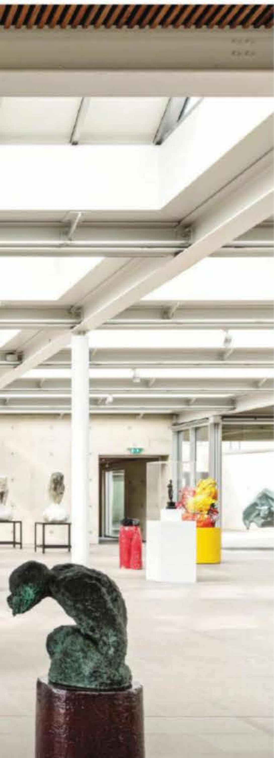
1. Opening of the Naked Roots exhibition.