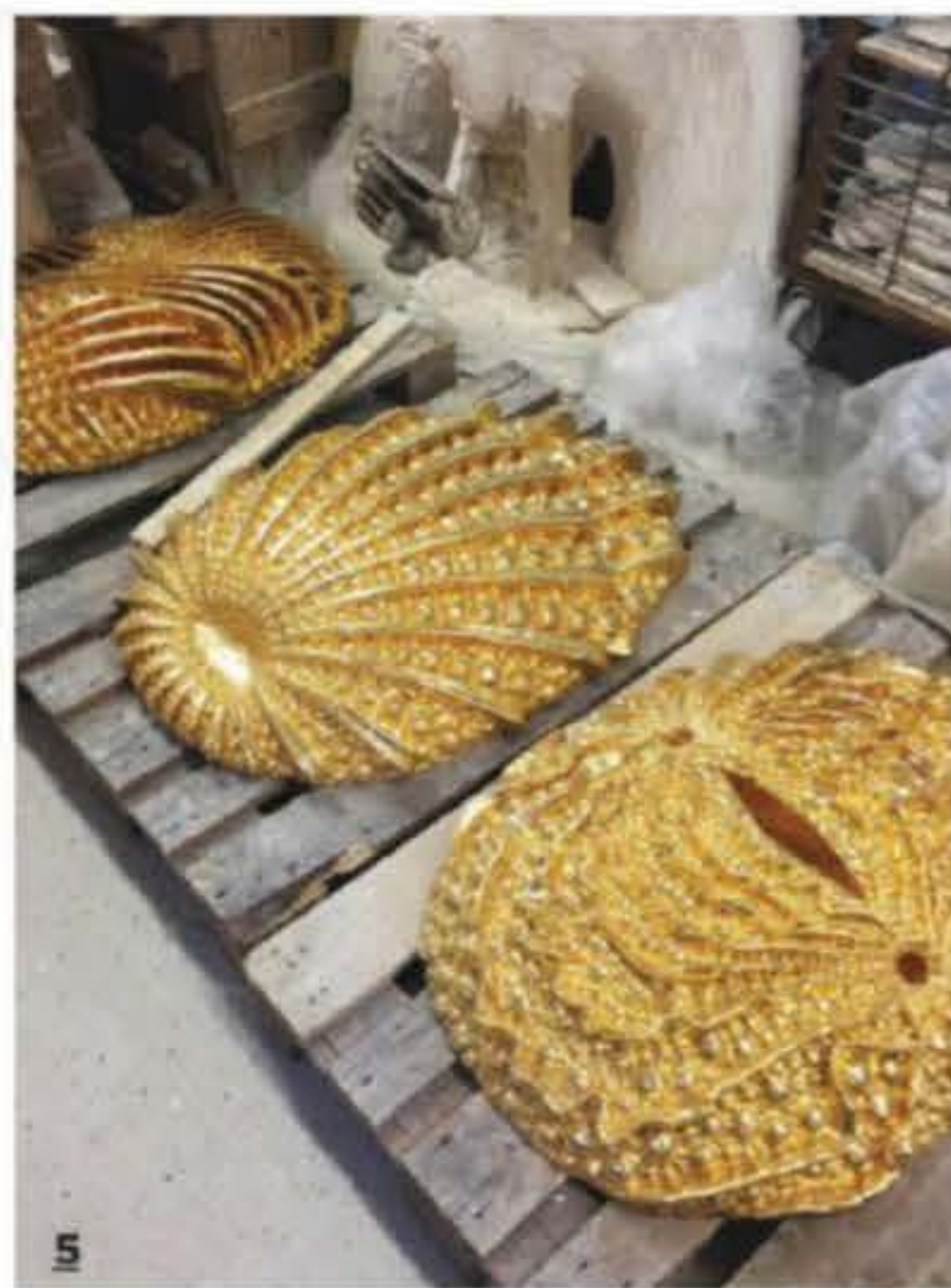
5. Partially completed artworks in Johan's atelier.

"Clay is a very loaded material because it's the earth we walk on," he says. "In a lot of cultures, it's called Mother Earth. It's sacred but at the same time it's the poorest of materials. It's basically human waste, so normally