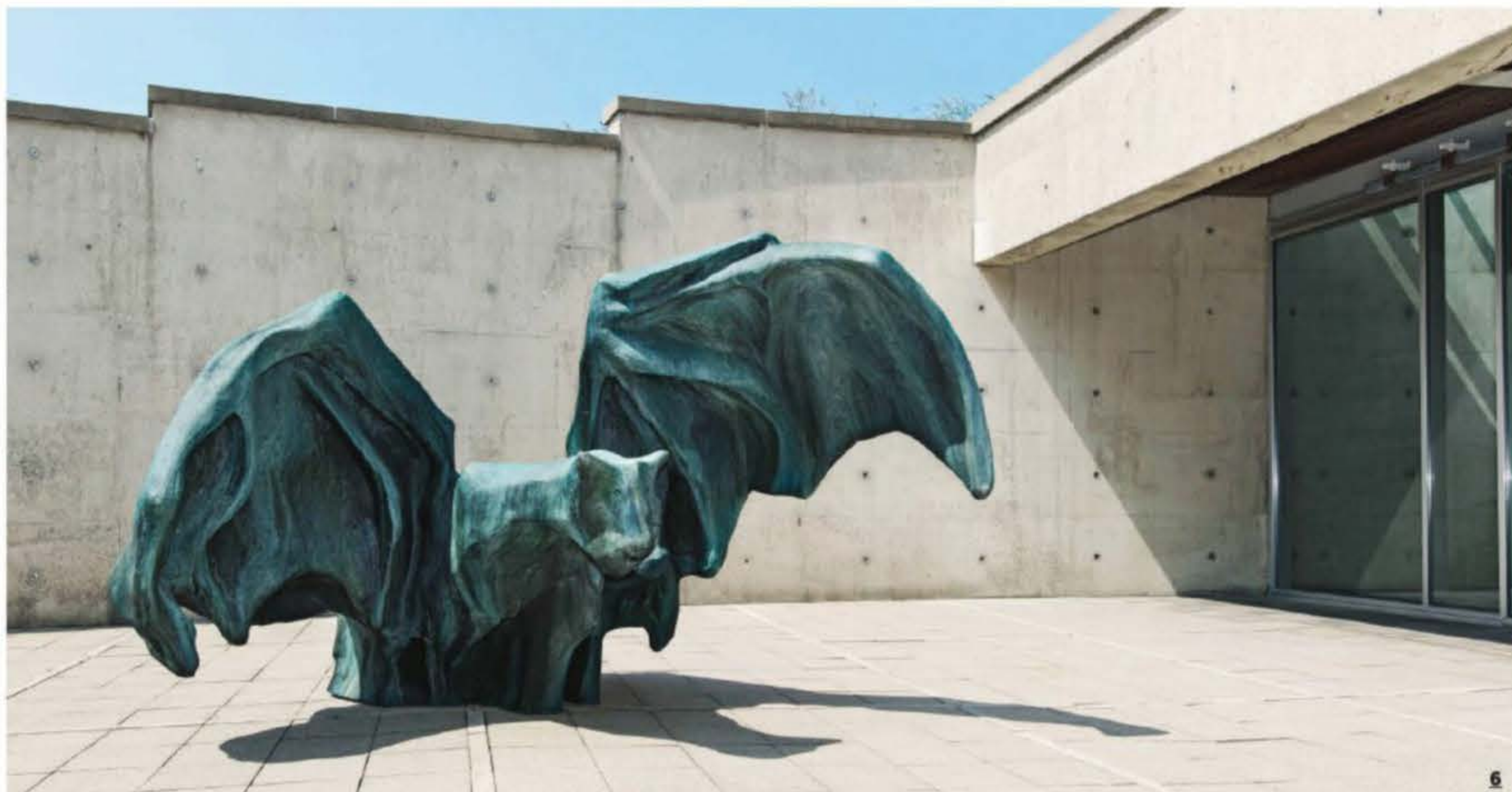
6. De Vleermuis resin sculpture at the Beelden aan Zee museum, The Hague.