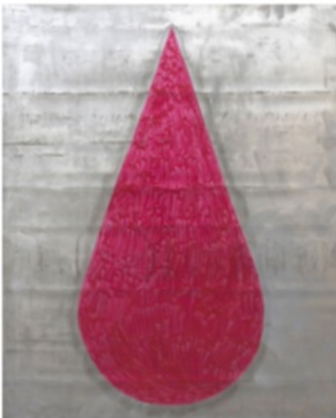
Left: 45 CHANEL 66 L'INDOMABLE, 2018. Lead, lipstick, plexiglass cover. Framed: 53 x 43 x 8 cm | 20 7/8 x 16 15/16 x 3 1/8 in