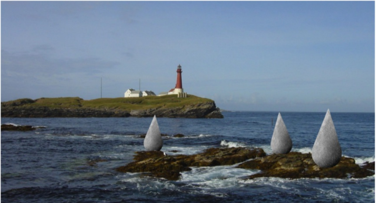
Tears, 2015. Video. Duration : 00:09:00 | 00:09:00 (simulation)

In "SALT", three teardrop-shaped blocks of salt dissolve into the returning tide on a distant Norwegian shore. Their surrender to the elements is transmitted live via projection into the Perrotin gallery space, offering a playful testimony to the transitory nature of existence.