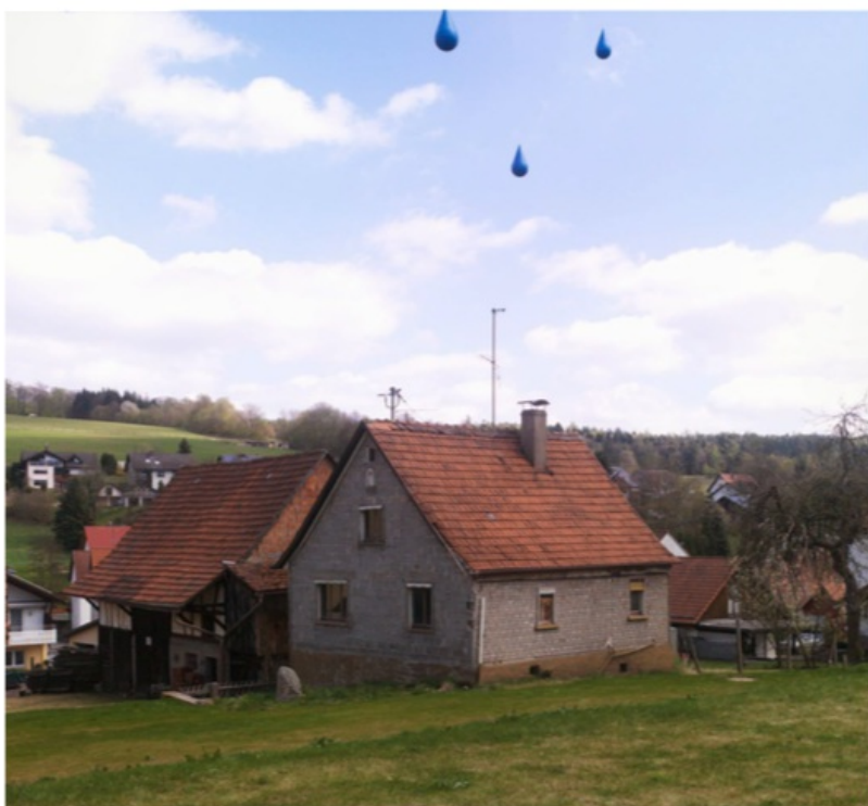
Left: Cowboy's Tears 2, 2018. Rope, polyester resin. 445 x 95 x 95 cm | 175 "16 x 37 "11 x 37 "11 in Right: Tears, 2015. Video. Video Duration : 00:09:00 | 00:09:00