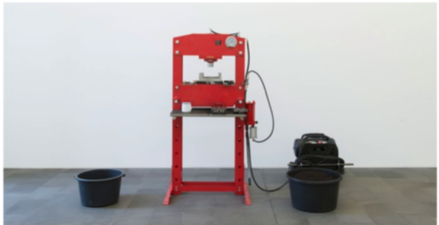
Right: Tränenpresse, 2018. Coal, hydraulic pump. : 186 x 90 x 85 cm | 73 1/4 x 35 3/8 x 33 1/2 in. 60 x 52 x 52 cm | 23 5/8 x 20 1/2 x 20 1/2 in