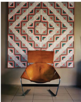
PERSONAL SPACE Above: Paulin's 1963 F444 chair in front of a Canadian quilt. Right: The designer's drafting table, featuring his portrait, a photo of his 1971 Élysée pedestal tables and a miniature of his 1966 Ribbon chair.

In 1950, Paulin enrolled in the École Camondo, the prestigious Parisian design school that opened