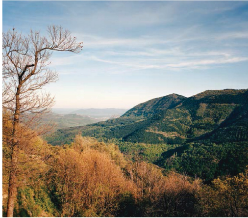
SENSE OF PLACE Far left: The living room at La Calmette, with Paulin's Tongue chairs, the Milan Cathedral bookcase he built for the house in 1990 and a 1984 prototype for the Diwan rug, now a Paulin, Paulin, Paulin limited edition. Left: The Cévennes landscape. Below: A vintage Eero Saarinen table stands next to the home's fireplace.