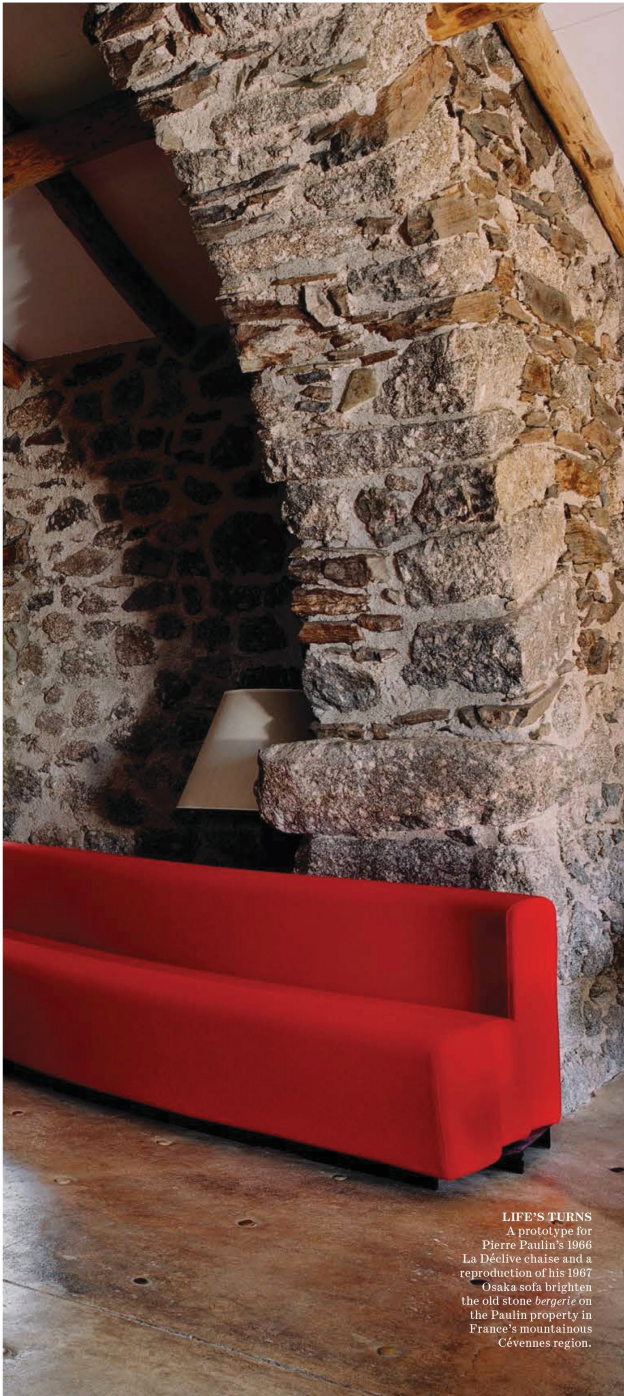
LIFE'S TURNS A prototype for Pierre Paulin's 1966 La Déclive chaise and a reproduction of his 1967 Osaka sofa brighten the old stone bergerie on the Paulin property in France's mountainous Cévennes region.