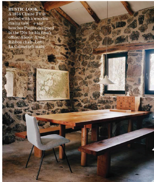
RUSTIC LOOK A 1954 Chaise TV is paired with a wooden dining table and benches Paulin designed in the '70s for his firm's offices. Above: A red Paulin's Tongue chair. Left: La Calmette's main