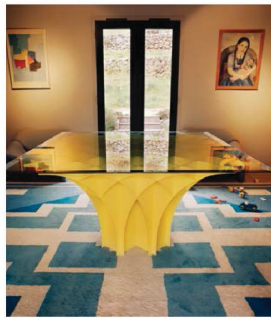
TRUE ORIGINALS Far left: Blue Mushroom chairs surround an early '70s prototype for one of Paulin's Élysée tables. Left: The model for the 1981 Cathedral table on a 1987 version of the Jardin à la Française rug; both are now produced by Paulin, Paulin, Paulin. Opposite: The living room's Diwan rug was designed to rise from the floor up the wall.