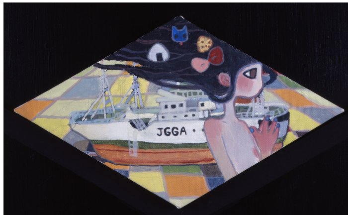
Aya Takano "Present: we had a natural disaster, a ship landed in the field" 2011 Acrylique sur toile / Acrylic on canvas 22 x 38,1 cm / 8 3/4 x 15 1/4 inches ©2011 Aya Takano/Kaikai Kiki Co., Ltd. All Rights Reserved.