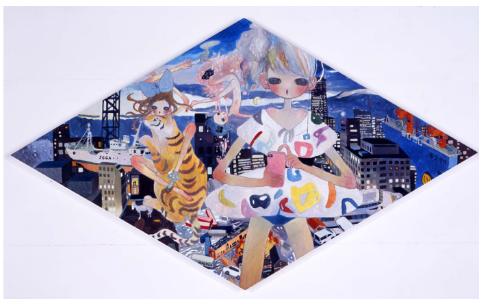
Aya Takano "Present" 2011 Acrylique sur toile / Acrylic on canvas 150 x 260 cm / 59 inches x 8.6 feet ©2011 Aya Takano/Kaikai Kiki Co., Ltd. All Rights Reserved.