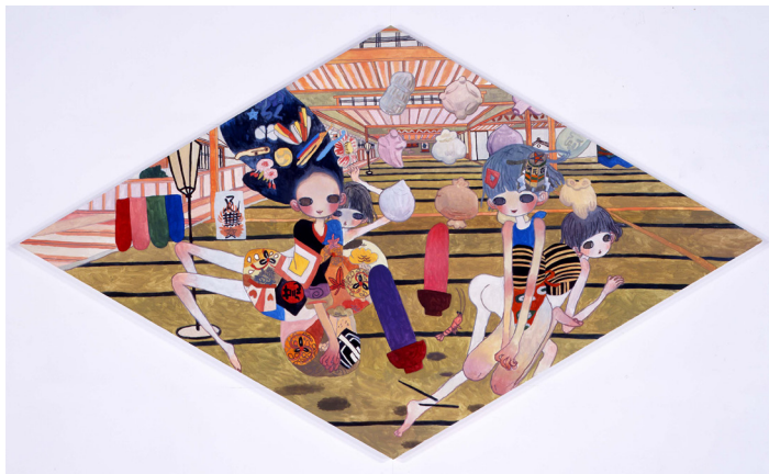
Aya Takano "Past: at the soshimai In shin-yoshiwara" 2011 Acrylique sur toile / Acrylic on canvas 150 x 260 cm / 59 inches x 8.6 feet ©2011 Aya Takano/Kaikai Kiki Co., Ltd. All Rights Reserved.