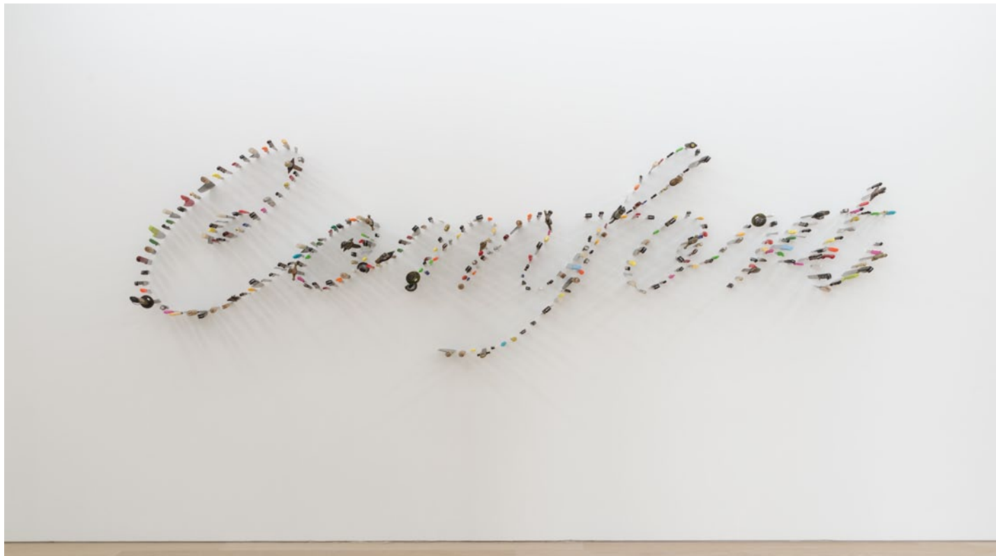
"Comfort", 2013 knives 110 x 350 cm / 43 1/4 inches x 11.5 feet