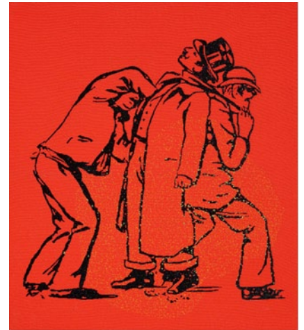
"Streetfighter Black on Red", 2013 Embroidery on canvas 137,5 x 119,5 cm / 54 1/4 x 47 inches