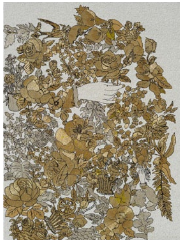
"Rose Garden", 2013 Embroidery on canvas 186 x 139 cm / 6.1 feet x 54 3/4 inches