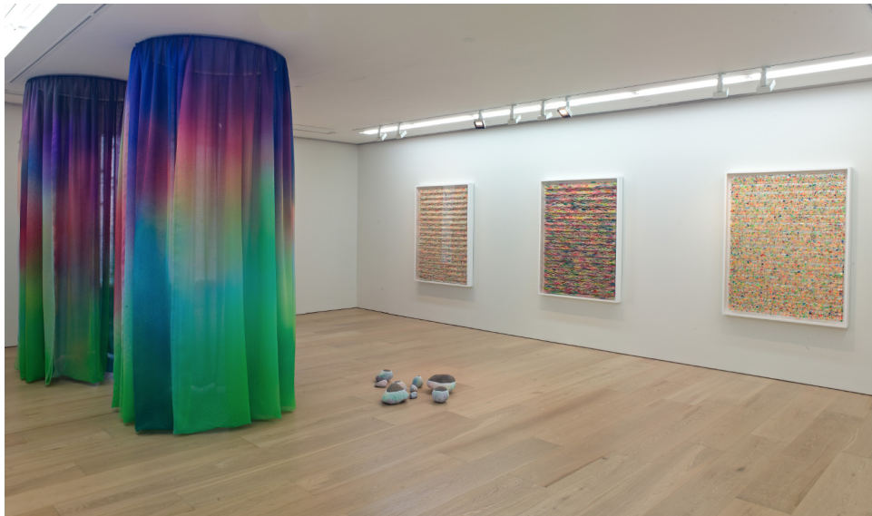
View of the exhibition Lionel Estève "To the Rain", Galerie Perrotin, Hong Kong.