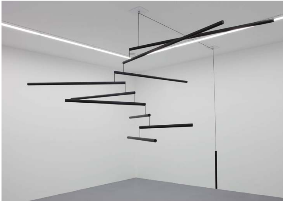
"Mobile (Orchestra)" 2011 Carbon tubes, composite rope, aluminium 200 x 450 x 450 cm (maximum volume) / 6.6 x 14.9 x 14.9 feet (maximum volume) Exhibition view, "Orchestra" 2011, Galerie Perrotin, Paris