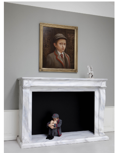
«High expectations», 2011 Fibreglass resin, polyurethane resin, acrylic, wood, acrylic paint, oil paint, hair, MDF, acrylic, wax, oil paint on canvas. 240 x 300 x 90 cm / 7.10 feet x 9.10 feet x 35 1/2 inches

2009 : «Where do we go from here ? Selections from La Coleccion Jumex», Bass Museum of Art, Miami ; «Romantische Maschinen», Georg Kolbe Museum, Berlin ; «The Making of Art», Kunsthalle Schirn, Frankfurt am Main ; «LYST», Overgaden, Institut for Samtidskunst, Copenhagen ; «New Aquisitions», Louisiana Museum of Modern Art, Humlebaek ; «En todas as partes», Politicas de diversidad sexual na arte - CGAC - Centro Galego de Arte Contemporanea, Santiago de Compostela ; «The Porn Identity» Kunsthalle, Wien.