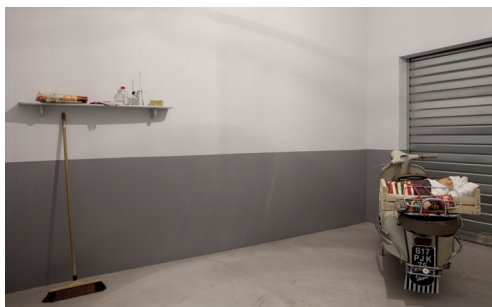
Untitled, 2011 Vespa, dummy in resin, bassinet 79 x 190 x 76 cm / 31 inches x 6.2 feet x 30 inches