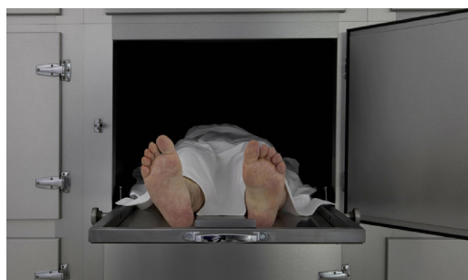
Untitled (detail), 2011 Steel, wood, dummy in wax 343 x 457 x 218 cm / 11.3 x 14.11 x 7.1 feet

For all images : Courtesy of the Artists & Galerie Perrotin, Paris