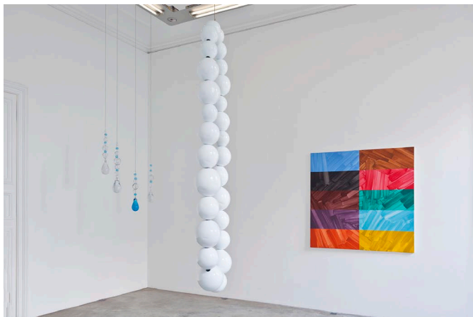
de gauche à droite / from left to right: Jean-Michel Othoniel «Larmes de verre» 2011 Verre de Murano, acier / Murano glass, steel approx. 65 x 12 x 12 cm (x7) / approx. 25 1/2 x 4 3/4 x 4 3/4 inches (x7)

Elmgreen & Dragset's new sculptural work «Unfinished Symphony (Ich bin doch kein Mahler)» addresses the question of the unfinished - the beauty of the imperfection that can be found in something not yet completed - within the process of creating. The monumental and sculptural rough draft of the composer Gustave Mahler's head is placed on a grand piano, which is not yet varnished with the normal glossy black lacquer, but rather still appears in its original raw wood. This stripped-down version of a traditional bourgeois interior references Mahler's 10th Symphony, which remained unfinished after the composer's premature death at the age of 50. A four meter high bronze sculpture depicting a young boy on his rocking horse and on view until 2013 has been produced for The Fourth Plinth Commission 2012 in Trafalgar Square in London .