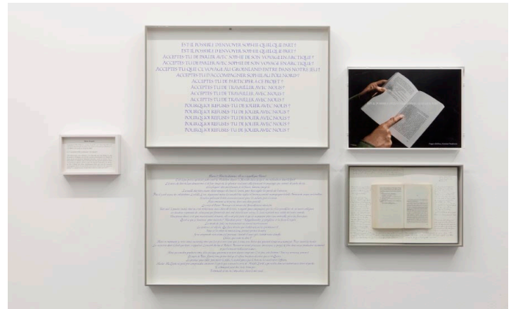
Sophie Calle "Où et Quand ? Nulle Part. Question 15" 2012 Textes calligraphiés, photographies couleur sous plexiglas, livres, textes manuscrits, chaîne et pendentif Tiffany, encadrements en fer, livre dans armature métallique, texte de présentation, encadrement en bois / Calligraphic texts, color photographs under Plexiglas, books, manuscripts, chain and pendant Tiffany, iron frames, book in metal frame, introduction text, wooden frame / Installation de dimension variable / Installation of variable dimensions

For all images : Courtesy of the Artists & Galerie Perrotin, Paris