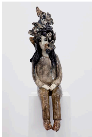
Klara Kristalova « Still remaining » 2012 Grès émaillé / Glazed stoneware 88 x 26 x 38 cm / 34 3/4 x 10 1/4 x 15 inches