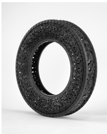
Wim Delvoye Sans titre / Untitled 2011 Pneu de voiture taillé à la main / Handcarved car tyre ø 68 x 13 cm / ø 26 3/4 x 5 1/4 inches

The exhibition will also comprise a new work by Lionel Estève (Untitled, 2012); two paintings by Bernard Frize (« Calu », 2011 and « Vestal », 2008); a work by Gelitin (Untitled, 2012); an installation by Guy Limone (« 160 out of every 1000 Americans own a passeport », 2007); a new series of five photographs by Kolkoz ; a sculpture by Klara Kristalova (« Still remaining », 2012); a new painting by Takashi Murakami (« The Singularity of Fate: Counting Teary-Eyed Stars... », 2011); a triptych by Paola Pivi (Untitled, 2005); a film (« Drumball », 2003/2011) and two sculptures from the series « The Architects » (« Philippe Bona » et « Elisabeth Lemercier », 2009) by Xavier Veilhan .