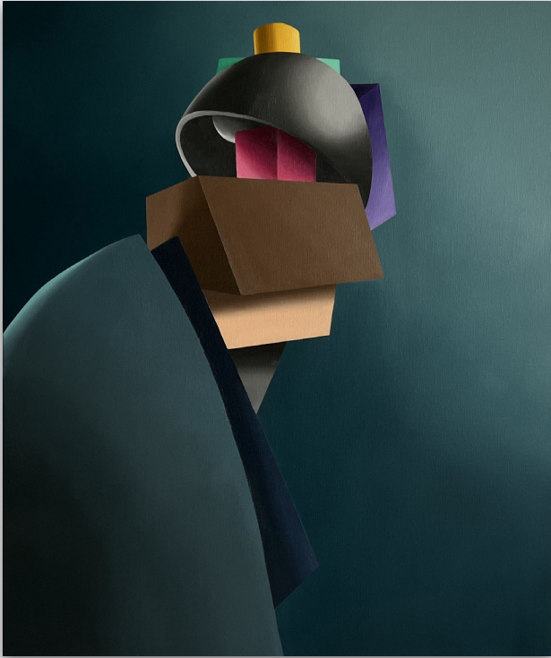
杰森·博伊德·金塞拉 Jason Boyd Kinsella Keith , 2022. 布面油画 | Oil on canvas. 120 x 100 cm.