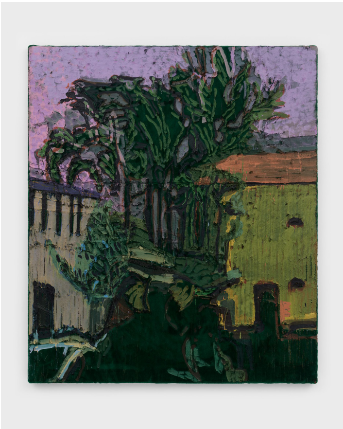
克莱尔·特伯莱 Claire Tabouret Paysages d'intérieurs, 2022. 丙烯、织物 | Acrylic on fabric. 213.4 x 182.9 cm.

我们将着重展示一系列画廊近期开始合作的艺术家。作为 70 年代末和 80 年代纽约另类文化和朋克艺术界的核心成员， 简·迪克森 是纽约复杂生动的创意社群发展过程中的重要人物，她带来了罕有展出的 2010 年代初的“梦幻世界”系列作品，记录了美国城市嘉年华和游乐场设施等场景。简·迪克森是美国艺术历史关键时期的参与者与见证者，北京 UCCA 尤伦斯当代艺术中心于 10 月开幕的大型群展“下城往事：1980 年代的纽约艺术现场”亦展出了艺术家的重要作品； 上条晋与杰森·博伊德·金塞拉 于近期加入贝浩登并分别推出了全新个人展览， 尚·马利·阿普里欧 的中国首展正于贝浩登上海空间举行；此外， 玛蒂尔德·丹尼斯、卡西娅·圣希莱尔、卡拉·乔思林与宋琨 的创作呈现则延续了画廊对国际视野内不同代际的女性艺术家的关注。