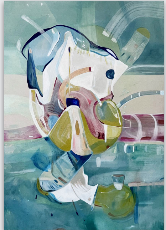
玛蒂尔德·丹尼斯 Mathilde Denize Figures , 2022. 布面油画与水彩、珠光颜料 | Oil on canvas, watercolor on canvas, pearlescent pigments. 162 x 114 cm.