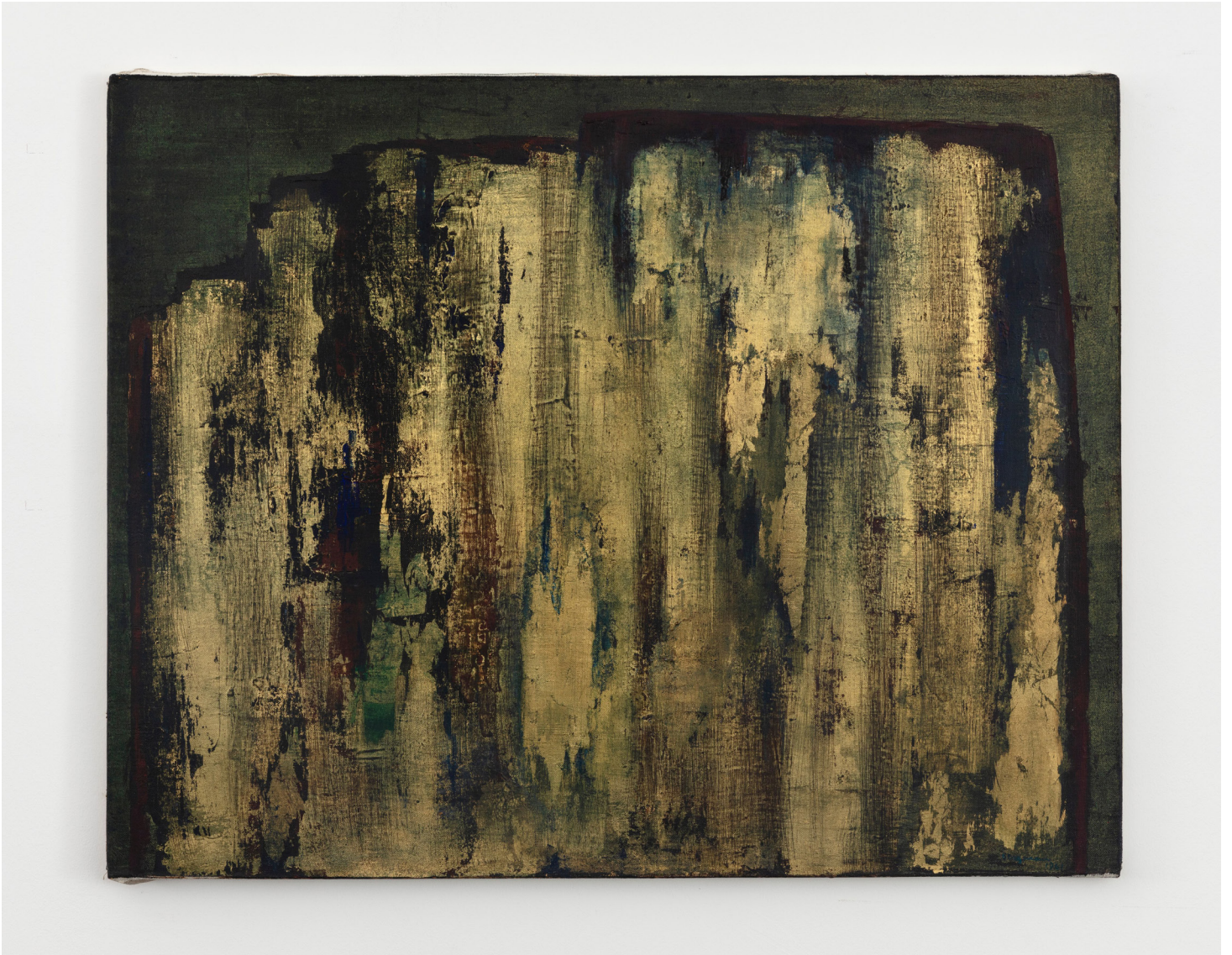
安娜-伊娃·伯格曼 Anna-Eva Bergman