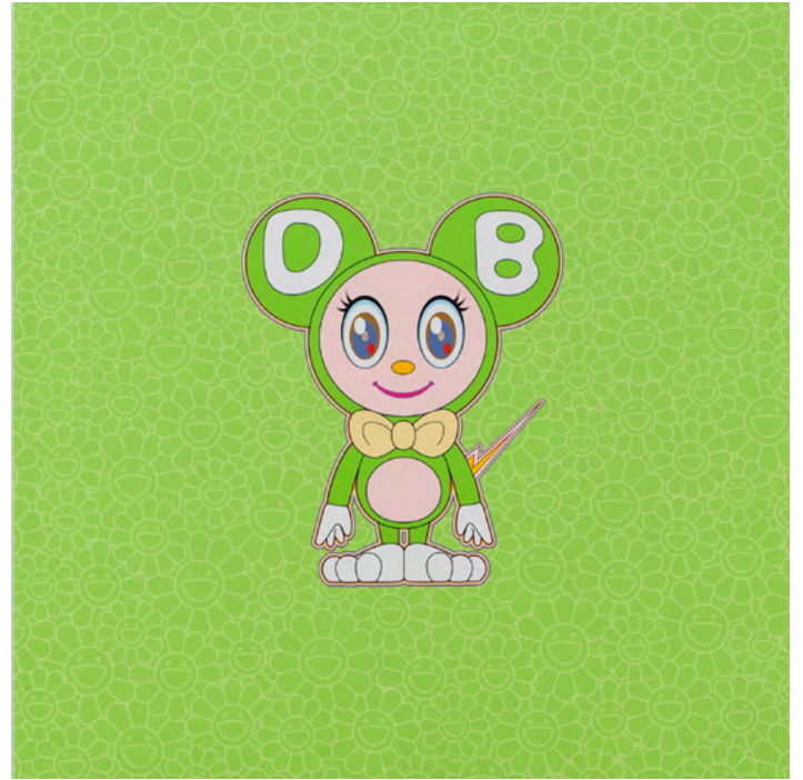
Untitled, 2020. Acrylic on canvas mounted on aluminium frame, 100 × 100 cm. ©2020 Takashi Murakami/Kaikai Kiki Co., Ltd. All Rights Reserved. Courtesy Perrotin.

Also on view: new paintings from the body of work Murakami.Flowers . A component of NFT project Murakami.Flowers, the pixelated flower paintings by Takashi Murakami combine the artist's iconic Superflat aesthetic with the nostalgia of the graphics of 1970's Japanese games. The series was conceived around the key number 108 associated with the Buddhist principle of bonnō , or earthly temptations; 108 backgrounds, 108 flower colors, 108 fields. As the artist states, "The existence of Murakami.Flowers extends beyond blockchain." Each flower of this series is unique, crafted by hand and required thousands of hours of work. Through the adaptation of an NFT into the real world, the artist bridges the physical and digital realms in order to trigger a cognitive revolution.