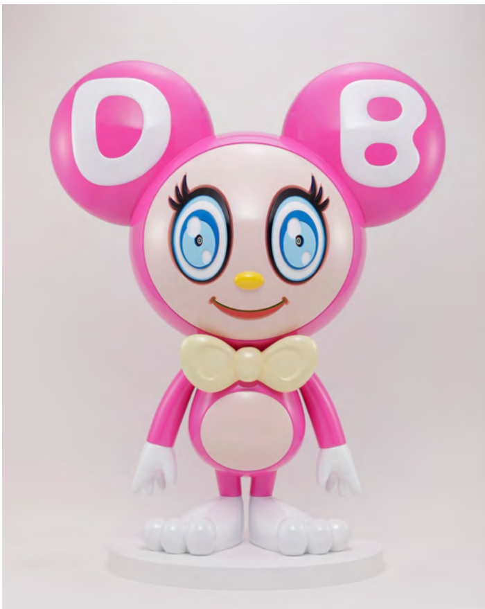
DOB (pink). FRP, urethane paint, stainless steel, wood, 87,1 × 68,8 × 47 cm (including pedestal). 20 Editions + 2 AP + 2 SP AP1 or SP1.

The exhibition opens with a series of sculptures and paintings dedicated to Mr. DOB , the artist's iconic character created in 1993. Mr. DOB's design was inspired by several animated figures such as Doraemon, Sonic and Mickey Mouse. His name is a diminutive of the expression "doboite" meaning "why" in Japanese slang. Mr. DOB has undergone many transformations over the years, but is still recognizable by the letters of his name on his face and ears. Accompanying Takashi Murakami in his existential questioning, the DOB character has developed a complex psychology, to the point of becoming the artist's avatar.