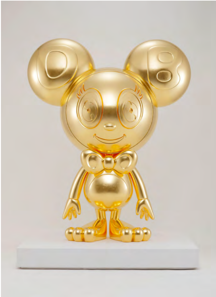
DOB (Gold), 2019 - 2020. Gold leaf on FRP, 158,4 × 130,4 × 82,8 cm. ©2019 - 2020 Takashi Murakami/Kaikai Kiki Co., Ltd. All Rights Reserved.