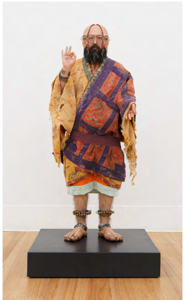
Untitled, 2017. Silicon, FRP, 70 × 35 × 35 cm. 1/5 Editions + 2 AP. ©2017 Takashi Murakami/Kaikai Kiki Co., Ltd. All Rights Reserved.

Lastly, the robot sculpture Arhat completes this exhibition. This ironic self-portrait refers to the theme of the Arhats –the clairvoyant disciples of Buddha– that Murakami has been exploring for the past ten years with the monumental painting The 500 Arhats created for his retrospective in Qatar in 2012.