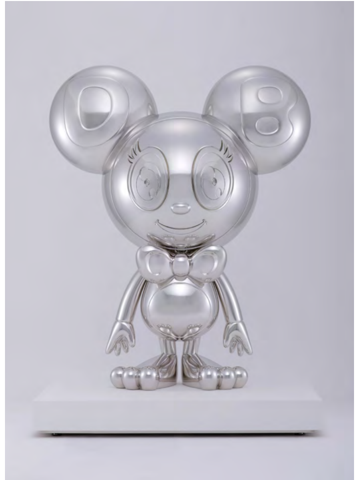
Mr. DOB (Platinum), 2019 - 2022. Platinum leaf on FRP, 173,4 x 130,4 x 130 cm (including pedestal). ©2019 - 2022 Takashi Murakami/Kaikai Kiki Co., Ltd. All Rights Reserved.