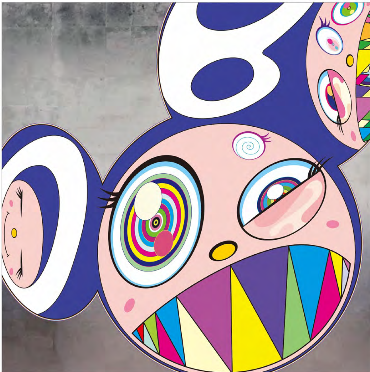
Untitled, 2022. Acrylic on canvas, 100 × 100 cm. ©2022 Takashi Murakami/Kaikai Kiki Co., Ltd. All Rights Reserved.