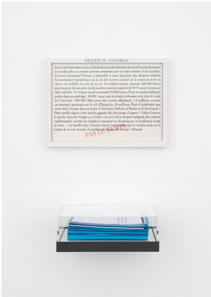
Pretium doloris - Pas le temps, 2023