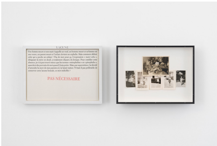
Lacune - Pas nécessaire, 2023