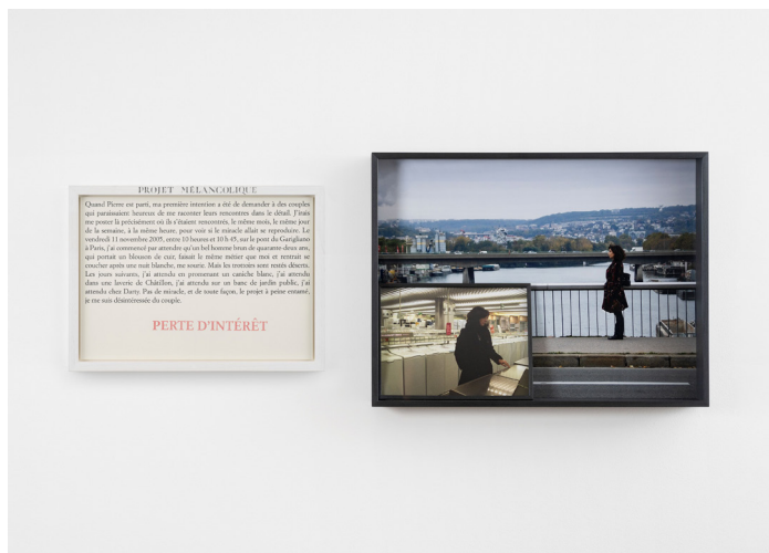
Projet mélancolique - Perte d'intérêt, 2023

A woman dies and her husband is called a widower, a man dies and his wife is a widow, a parent dies and the child becomes an orphan. But how do you define someone who has lost a child? There's no word for it. The expression « mater orba », referring to the grieving mother, has completely disappeared from the lexicon. The best I could come up with to fill the gap were the terms « mèrepheline » and « pèrephelin », associated with portraits of me as a child. But, out of superstition, I decided to wait until after my parents' death and let it linger. Wasn't it better to keep this lexical gap, this unspeakable word?