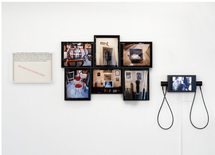
Une très bonne soirée somme toute - Manque de conviction, 2023