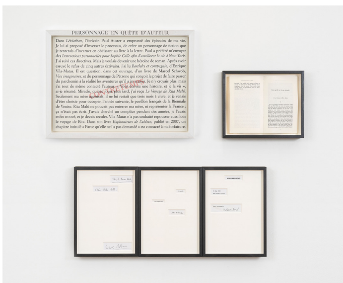
Personnage en quête d'auteur - Contretemps, 2023

I'm interested in the price of pain, compensation for the more or less intense physical and moral suffering experienced by an accident victim. Lawyer Emmanuel Pierrat compiled for me files entitled Hypothetical reconstruction of victims' lives based on the notion of loss of chance or Life price scale . A minor child received 100,000 francs for the loss of his or her father or mother, a sum increased by 50% for a minor who was already an orphan. A married adult received 50,000 francs. For a Filipino sailor lost in a shipwreck: 30,000; for a Polish student killed in the Concorde crash: 900,000. But for a German victim, 7.2 million, and for an American passenger on the EgyptAir flight, 28 million. Was it better for your husband to crash on American Airlines, Iberia or Air France? In which region did your leg earn more money? Was it better to lose it in the Vosges or in Paris? The price of pain included sophisticated notions such as static or dynamic disgraces, suffering before death... The family was better compensated if the victim had had time to see himself die. How much for a minute of terror? Abysmal.