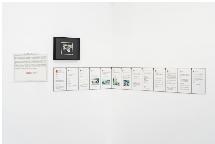
Les deux Sophie Calle - Interrompu, 2023