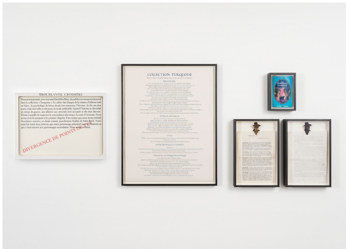
Troublante croisière - Divergence de points de vue, 2023