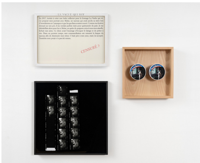
La vache qui rit - Censuré ?, 2023

In 2006, as part of my research into women with the first and last name Sophie Calle, I hired a detective from the Duluc agency. The result exceeded my expectations. He had found only two in the whole of France, but they had been born in the same hospital, lived a hundred kilometers from Paris, in the same town, and worked in the same factory. One was called CALLE by marriage, the other by birth. According to the private eye, the Sophie Calle by birth lived in isolation and wished to be left alone, having experienced very serious family problems , as he modestly described them. He didn't want to investigate any further and dissuaded me from going there. I postponed it.