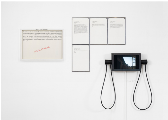
Wim Wenders - Autocensure , 2023

I didn't believe in it anymore, but I contacted the author anyway. «You write a story, and I live it,» I summarized. Miracle, a fortnight later I received The Journey of Rita Malú . Only my mother was dying, she had only three months to live, and I had just been chosen to occupy the French pavilion at the Venice Biennale the following year. Rita Malú couldn't bury my mother, nor represent France; it wasn't written in stone. I'd been looking for an accomplice for years, finally found one, and had to back out. Vila-Matas had no wish to postpone Rita's journey so far. In his book Explorateurs de l'abîme , published in 2007, a chapter entitled «Because she didn't ask for it» is devoted to my forfeit.