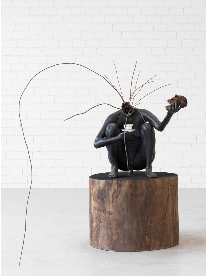
Bharti Kher, And all the while the benevolent slept , 2008. © Bharti Kher.