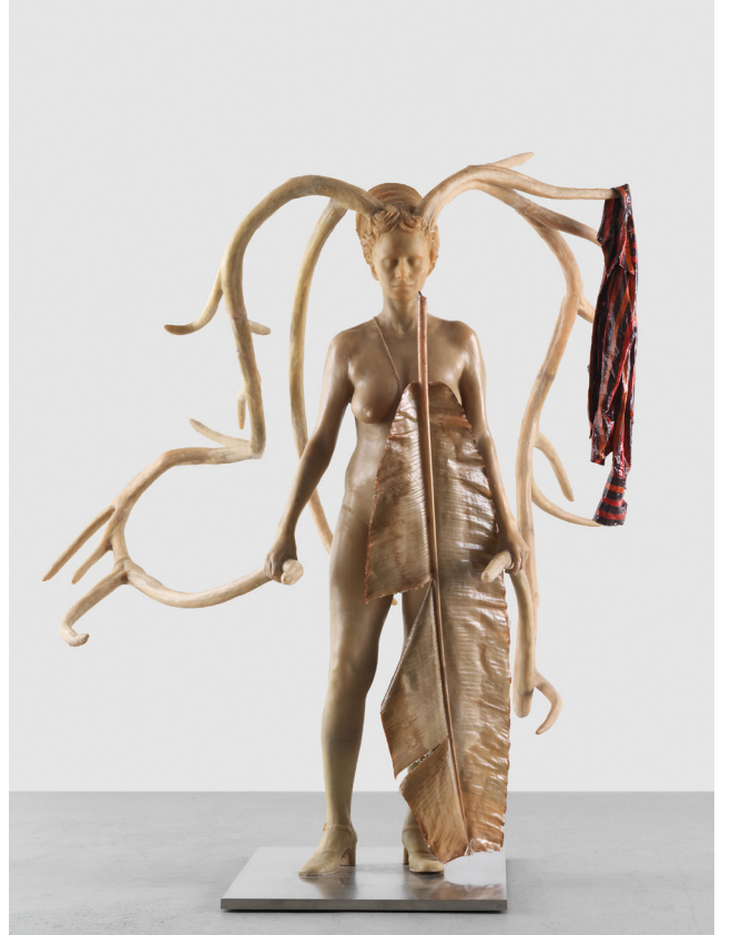
Top: Bharti Kher, The hot winds that blow from the West , 2011. © Bharti Kher. Courtesy the of artist and Hauser & Wirth. Photo © Genevieve Hanson.