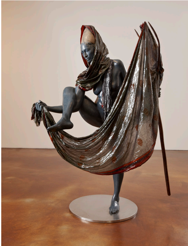
Bharti Kher, Cloud Walker , 2013. © Bharti Kher. Courtesy of the artist.

She presents woman as mother, sex worker, monster, warrior, and deity, often hybridised with animals or as avatars of the goddess. Her mythical characters blur the boundaries between humankind, nature and narrative, revealing expansive potential and new meaning. Cloud Walker (2013) is inspired by Tibetan mythology of the Dakinis, the women that walk the skies and embody all things feminine. Appearing throughout history in both goddess and human form as an ever-changing energy and force of truth, she is both a fierce and compassionate divinity that exists between worlds, between sleeping and waking, life and death.