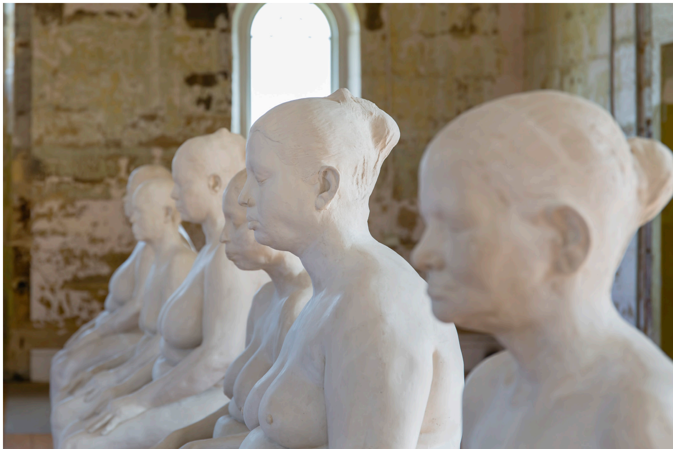
Bharti Kher, Six Women , 2012-14. © Bharti Kher. Courtesy of the artist and Perrotin. Photo © Ben Symons.