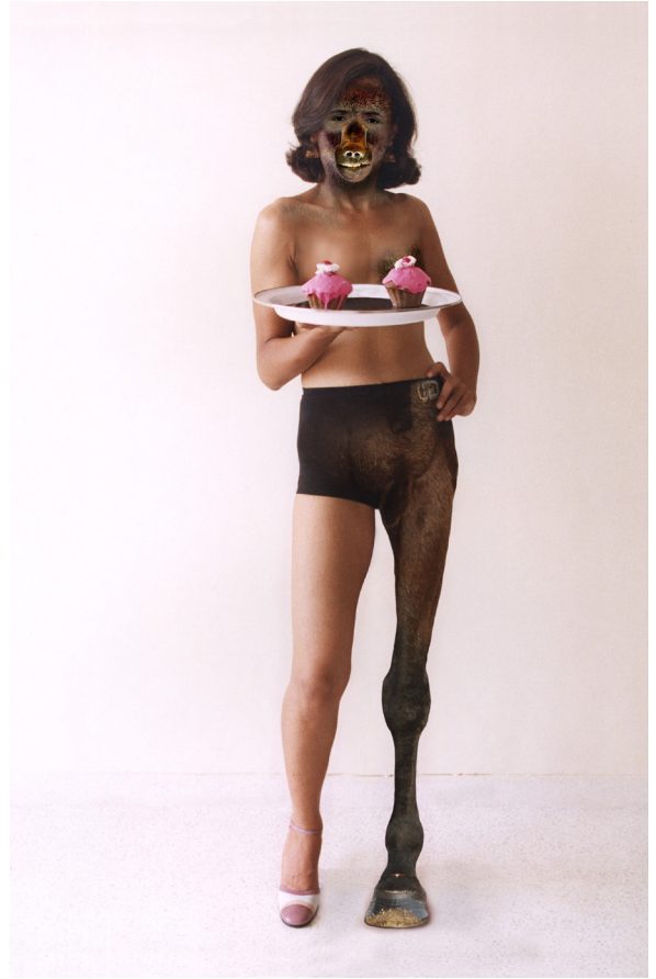
Bharti Kher, Chocolate Muffin , 2004.