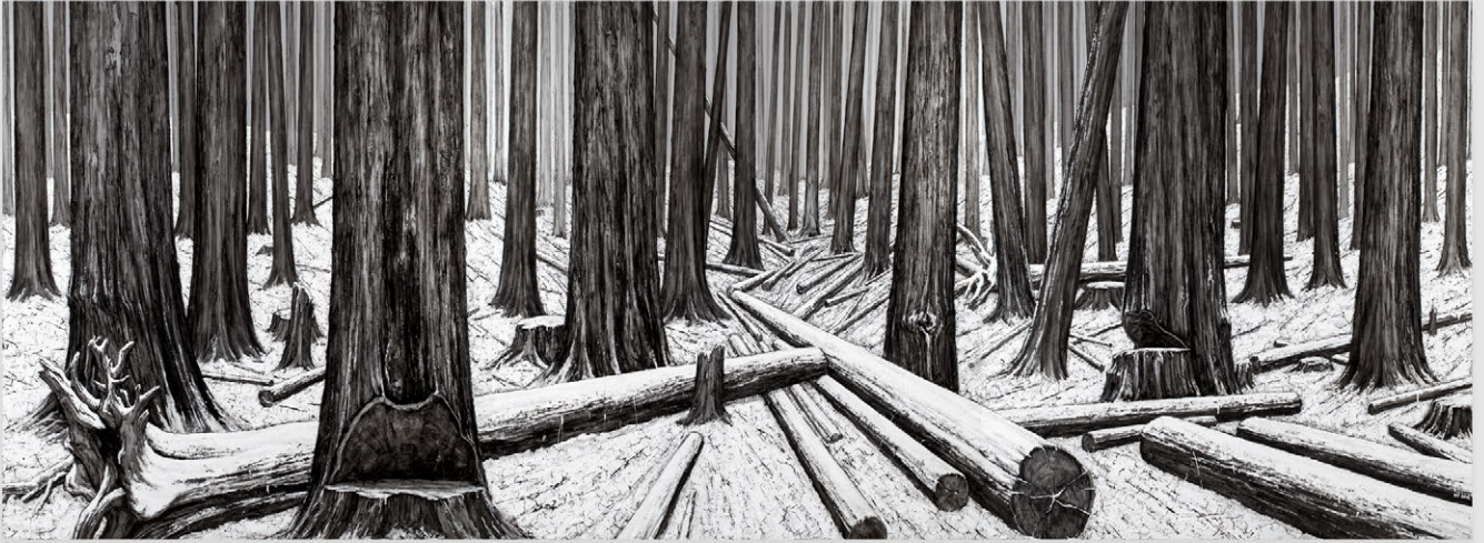
Relic / 遺跡 , 2018. Mixed media on canvas. 220 × 600 cm / 86 5 / 8 × 236 1 / 4 in.