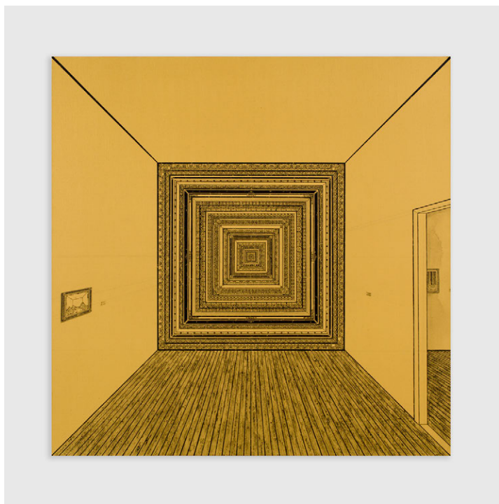
Orchestra / 樂團 , 2017. Acrylic on canvas. 120 x 120 cm / 47 1/4 x 47 1/4 in.

也可視為對於自我身體、情緒以及環境或空間的一種丈量。它不僅懷疑理性秩序，對於身體的感官機制也同樣保持著警惕。更重要在於，它提示我們，一切既有的標準乃至觀看和認知秩序都是被建構的。可見，倪有魚真正質疑的與其說是既有的標準和秩序，不如說是支撐標準和秩序的普遍原則和抽象邏輯，說到底，一切權力和暴力的源頭正是這些邏輯、原則及其普遍性。就像「水沖」本身潛在的行動性及其暴力感，大多時候，恰恰被包裹在節制、內斂的美學內部。