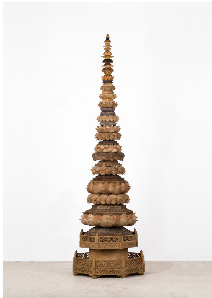
Pagoda No. 8 / 浮屠之八 , 2017. Wood, steel. 207 x 63 x 63 cm / 81 1/2 x 24 13/16 x 24 13/16 in.