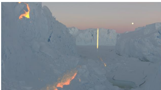
Laurent Grasso , ARTIFICIALIS , 2020, Film HR, 27'33" © Laurent Grasso / ADAGP, Paris 2021 - Courtesy Perrotin