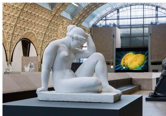
Laurent Grasso ARTIFICIALIS © Laurent Grasso / ADAGP, Paris 2020