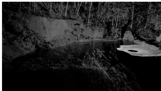
Laurent Grasso , ARTIFICIALIS , 2020, Film HR, 27'33" © Laurent Grasso / ADAGP, Paris 2021 - Courtesy Perrotin